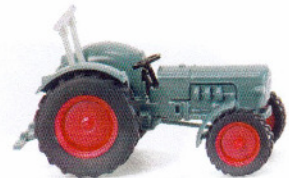
0871 41 Eicher Königstiger

W IKING is celebrating the 50th anniversary of the legendary British roadster being launched onto the market: 50 years of the Jaguar E-type which has become synonymous with the stylish tradition of English sports cars. Alongside it stands the intricately detailed classic Eicher Königstiger tractor that tracks the nuanced colourways of the former tractor manufacturer. Another vehicle making a reappearance is a dumper trailer which is more than four decades old. WIKING has breathed new life into the historic moulds for this trailer while at the same time producing a trailer that can be used with the Hanomag truck from its range of new models on offer. The Unimog U20 and