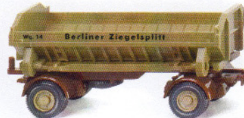
0850 49 Hanomag with dumper trailer