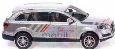
0133 05 Audi Q7