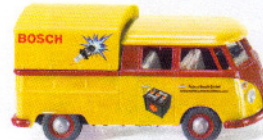
0789 03 VW T1 twin cab with tarpaulin