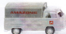
0316 02 VW T2 with tarpaulin