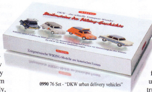
0990 76 Set - "DKW urban delivery vehicles"

since become mandatory. The Ford Escort Mark I as a proven youngtimer will appeal to fans of vehicles from the 1970s. The first Escort series in automotive history was given the name "dog-bone" on account of the shape of the radiator grille. Alongside this is the classic VW T2 flatbed truck which makes an appearance for the first time with a tarpaulin created using new moulds. The Hanomag truck with dumper trailer, the VW Beetle as a patrol car and the American International Harvester flatbed truck complete the wide variety of multi-faceted new vehicles on offer. WIKING-Modellbau GmbH & Co. KG Schlittenbacher Str. 60 58511 Lüdenscheid info@wiking.de · www.wiking.de