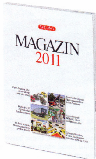
0006 18 WIKING magazine 2011

W IKING is celebrating the 50th anniversary of the legendary British roadster being launched onto the market: 50 years of the Jaguar E-type which has become synonymous with the stylish tradition of English sports cars. Alongside it stands the intricately detailed classic Eicher Königstiger tractor that tracks the nuanced colourways of the former tractor manufacturer. Another vehicle making a reappearance is a dumper trailer which is more than four decades old. WIKING has breathed new life into the historic moulds for this trailer while at the same time producing a trailer that can be used with the Hanomag truck from its range of new models on offer. The Unimog U20 and