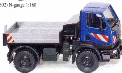
0369 02 Unimog U20