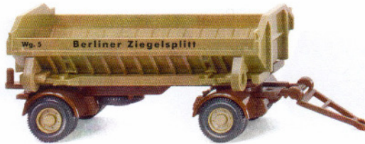
0675 49 Dumper trailer