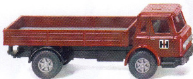
0446 01 Flatbed truck (International Harvester)