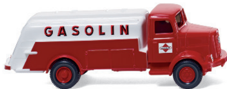
0781 01 Tanker (Henschel HS 100)