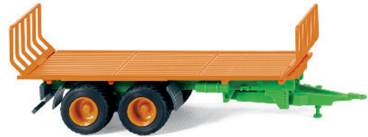
0388 13 Joskin feed transporter