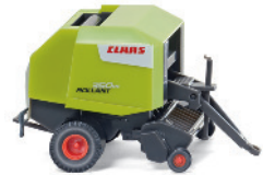
0384 03 Claas Rollant 350 RC round baler