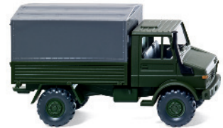
0695 05 Army - Unimog U 1300 L