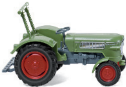
0899 04 Fendt Farmer 2