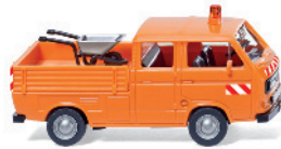
0293 03 Community services - VW T3 crew cab