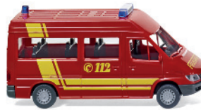
0601 26 Fire service - MB Sprinter Bus