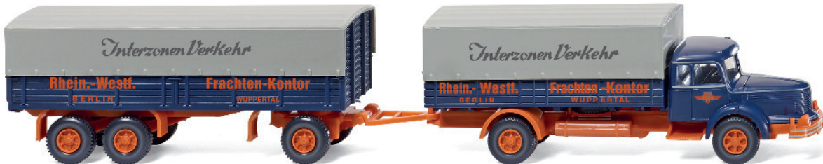
0480 03 Flatbed truck (Krupp Titan)

The focus of the WIKING model upgrading is on two absolutely up-to-date 1:87 large fire trucks. The first in the range is the Metz B32 heavy-duty rescue platform on the chassis of the Mercedes-Benz Eonic in the design of the „Straelen“ fire service and the Rosenbauer Panther 6x6, whose model is the fire truck deployed at the Braunschweig-Wolfsburg Airport. For N-gauge model train fans, the Rosenbauer RLFA 2000 AT is making its appearance in the model range. The