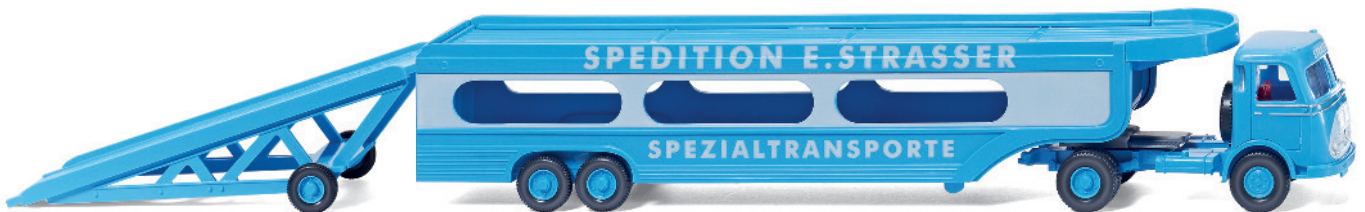
0580 49 Car transporter (MB Pullman)

The historical WIKING world comes to life – the building cut-out sheet of the 1950s matching the street map reprint does the trick! In only a very short construction time, a stylized WIKING city of those years comes into being, making an ideal backdrop for the historical models. And more new classic products as well as an exclusive range of accessories help you to design the street scenery just like it