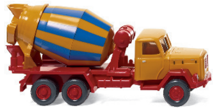
0682 02 Cement mixer (Magirus Saturn)