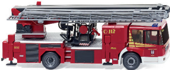
0628 47 Fire service - Metz B32 heavy-duty rescue platform (MB Eonic)