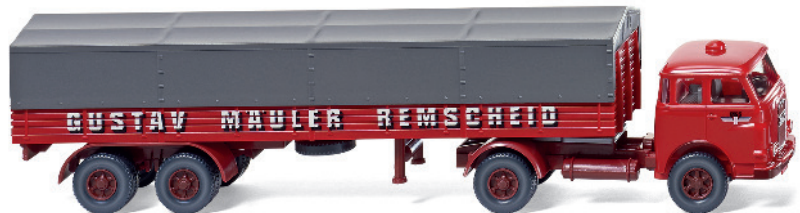
0514 02 Flatbed truck (MAN "Pausbacke")