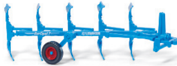
0378 02 Lemken EurOpal7 plow