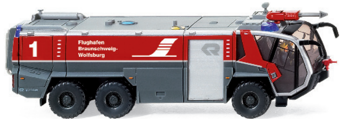
0626 05 Fire service - Rosenbauer FLF Panther 6x6