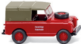
0861 26 Fire brigade - Land Rover