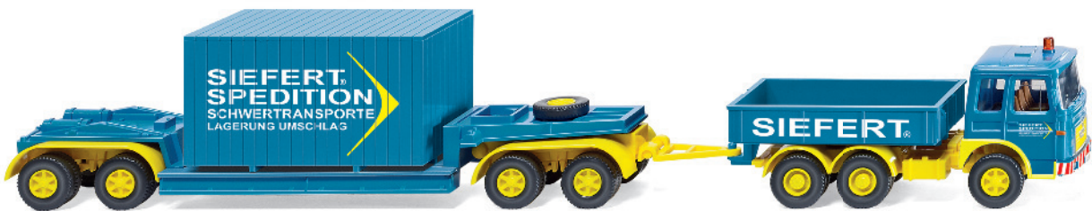
0504 02 Heavy duty truck (MAN 19.230)

Classics of the 1950s to 1980s will give WIKING a perfect start to 2014. The Büssing 8000 with a rear dump truck trailer is entering the scene for the first time as a construction site vehicle. The Magirus forward drive vehicle arrives as a municipal vehicle with an access platform, while the Mercedes-Benz L 1413 runs away for special use at THW. Back in the 1970s, the exemplars of the legendary MAN-Pausbacke were breakdown trucks and its successor MAN 19.230 was as a heavy duty truck on the road for the shipping company Siefert. The