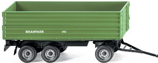
0388 12 Brantner three-axle trailer