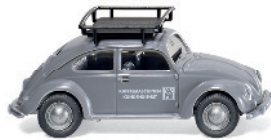
0830 14 VW "Pretzel" Beetle