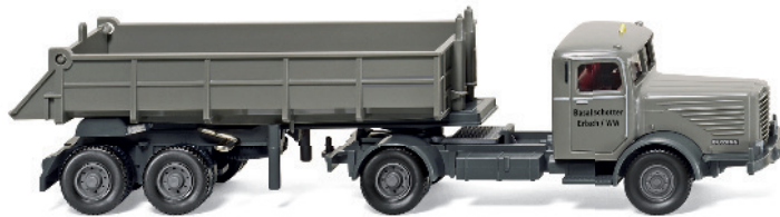
0677 01 Rear dump truck (Büssing 8000)