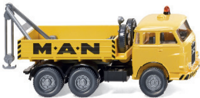
0634 01 Breakdown truck (MAN Pausbacke)