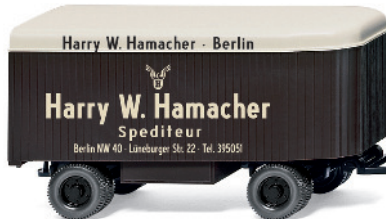
0851 01 Hanomag ST 100 with two furniture trailers