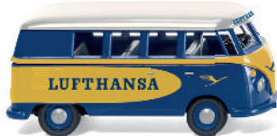
0797 12 VW T1 Bus