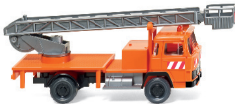
0644 01 Access platform vehicle (Magirus)