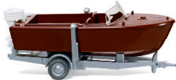
0095 01 Motor boat on trailer