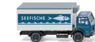
0942 06 Refrigerated truck (MB) N-gauge 1:160

1:87 model construction contrasts can hardly be more eye-catching. The then powerful Deutz tractor D40 L faces the Fendt 936 Vario, while the VW "Pretzel" Beetle from WMF faces the hp-strong VW Golf VI in the GTI model with eye-catching sports decor. WIKING's February model upgrades achieve miniatures full of character that could not be more authentic. For instance, the traditional model makers present the VW T1 Bus in the beautiful Lufthansa design