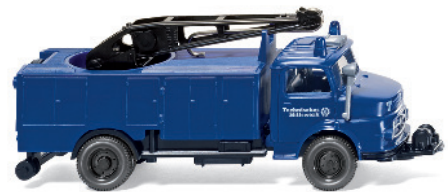
0693 21 THW - Rescue vehicle (MB L 1413)