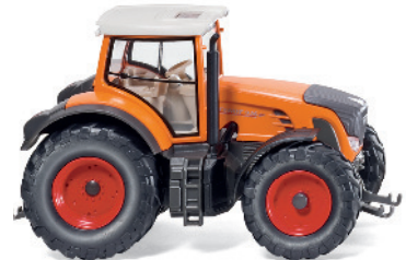
0361 02 Fendt 936 Vario