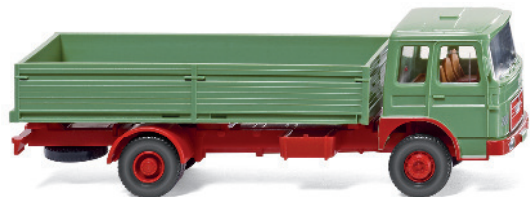
0519 01 Platform truck (MAN)