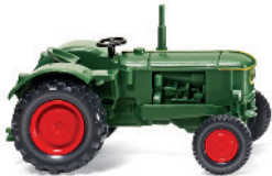
0881 02 Deutz-tractor D40 L