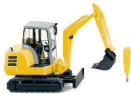
0658 04 HR 18 mini-digger