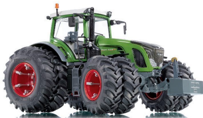
0773 23 Fendt 939 Twin-tyre tractor