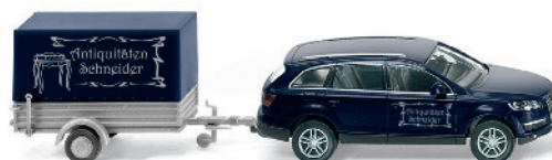
0133 06 Audi Q7 with trailer

Since WWII, automotive history has been shaped by classic small vehicles. That is why two new models joining the range are the Goggomobil with folding roof along with the Fiat 600. WIKING consulted historic documents during the production of both these models which are not only true to the original vehicles but also display a wealth of intricate details. Alongside these are further