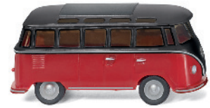
0317 01 VW T1 Samba van