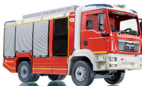
0431 99 Rosenbauer AT (MAN TGM) fire truck