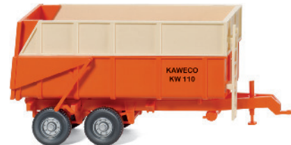
0387 02 (Kaweco) dump trailer