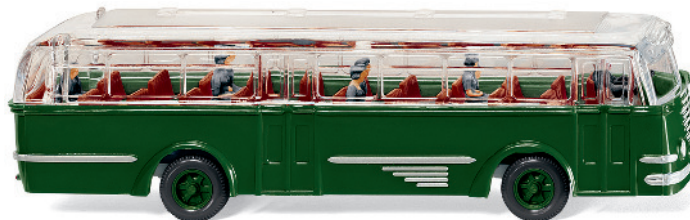
0720 01 Büssing forward drive bus with passengers