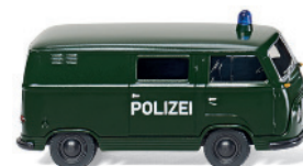
0864 23 Police vehicle - Ford FK 1000 box van