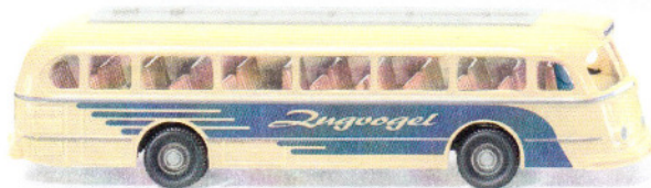
0700 01 Bus (MB O 6600 H Pullman)

This bus simply radiates that WIKING charm from the 1960s: along with the other model upgrades for February, the Mercedes-Benz O 6600 H Pullman has been fondly given a contemporary finish – the classic bus lives up to its name which translates as “migratory bird” and will de-finitely turn the heads of collectors. Beside it, the Lanz Bulldog makes a reappearance along with the enclosed