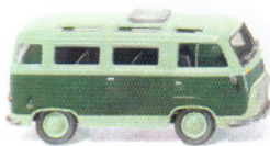
0289 99 Ford Transit Panorama bus