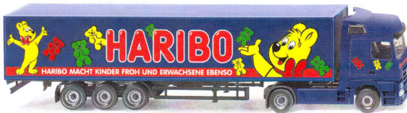
0538 15 (MB Actros) Semi-trailer truck