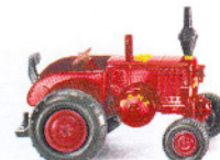
0880 04 Lanz Bulldog