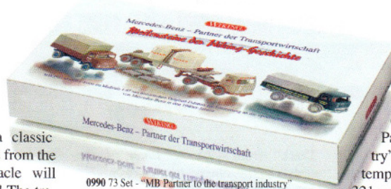
0990 73 Set - "MB Partner to the transport industry"

W IKING starts off the new model year with a classic offensive – automotive legends from the years of the economic miracle will delight 1:87 collectors in 2011! The traditional model-makers have created models of the original Goggomobil as well as the impressive Panorama version of the Ford Transit. WIKING's final member of the desirable trio of new models which will thrill so many fans of the brand is the Hanomag Diesel flatbed truck as all three models are classic vehicles which were once a common sight on the streets of the emerging