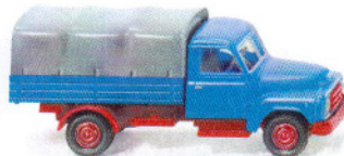
0345 01 (Hanomag Diesel) Flatbed truck vehicle