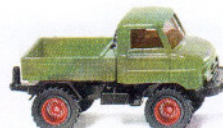
0371 03 Unimog U 411