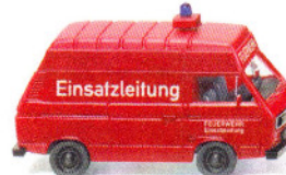
0601 21 VW T3 fire service