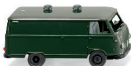
0270 48 Borgward B611 box van