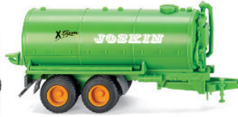
0382 39 Joskin vacuum tanker