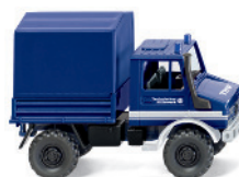
0693 16 TES - Unimog U 1700 with tarpaulin