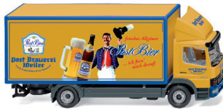
0435 05 MB Atego box truck