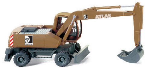
0661 02 Atlas 2205M mobile excavator