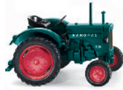
0885 04 Hanomag R16