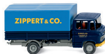
0271 01 MB L 408 Flatbed truck

Two new 1:87 classics represent an important step towards the attainment of milestones in WIKING's history: the '64 Ford Mustang and the Glas 1700 GT cabriolet will fulfil the long-cherished desires of collectors just in time for Christmas! These are joined by the Borgward B611 with its intricately detailed interior in the form of a prison van and the Opel Kapitän as a police patrol car. Other newcomers to the range include the TES Unimog U1700 along with the VW Caddy serving the Berlin Fire Service as well as the MB L 408 in the service of the Zippert haulage company and the LP 2223 heavy freight truck of