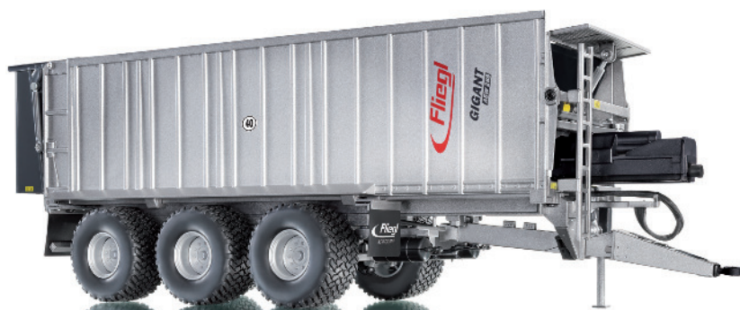
0773 13 Fliegl ASW288 dumper truck with tailgate