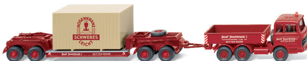
0504 01 MB LP 2223 Heavy freight vehicle