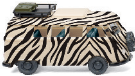
0797 09 VW T1 "Safari" campervan