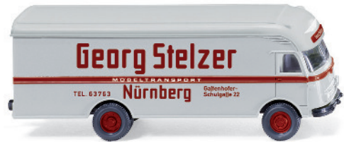
0500 01 Ackermann furniture removal van