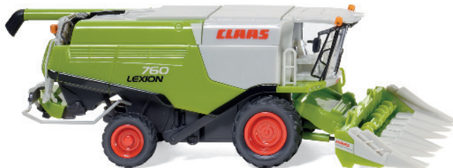
0389 11 Claas Lexion 760 combine with Conspeed corn header