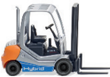
0663 39 Forklift Still RX 70-30H