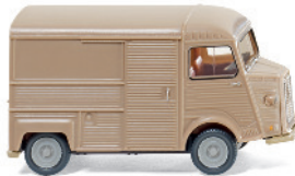
0262 01 Citroën HY panel truck