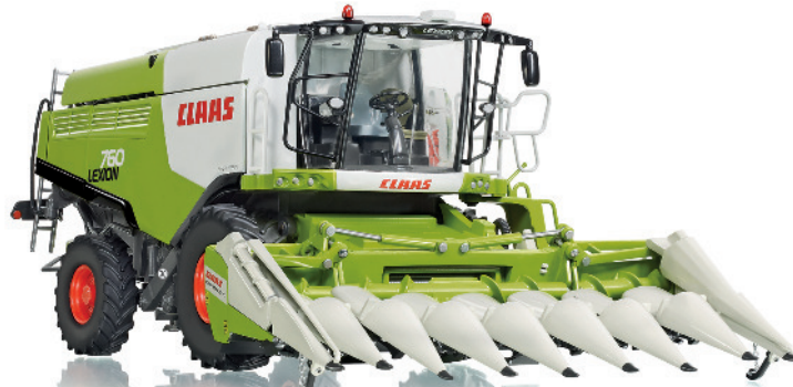
0773 40 Claas Lexion 760 combine with Conspeed corn header