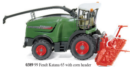
0389 99 Fendt Katana 65 with corn header

The breathtaking contrasts in scale, which will start WIKING fans and lovers of agricultural machines raving enthusiastically: The Claas Lexion 760 with Conspeed corn picker makes an impressive double debut in 1:87 and 1:32. Both model giants once again illustrate how much fun the WIKING love for details can be – and in such different scales, to boot! The Fendt Katana 65, likewise with