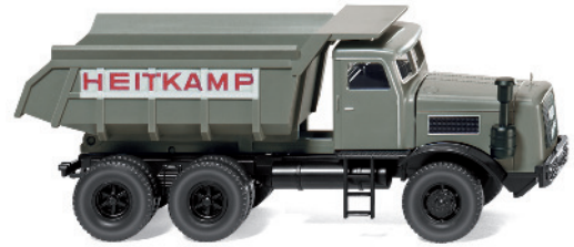
0866 36 Tipper trailer (Kaelble)