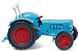
0871 42 Eicher Königstiger