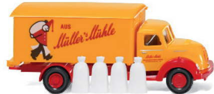
0540 49 Box truck (Magirus Sirius)