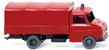
0861 27 Fire service - flatbed truck (Opel Blitz)