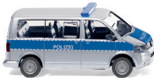
0104 48 Police - VW T5 GP Multivan