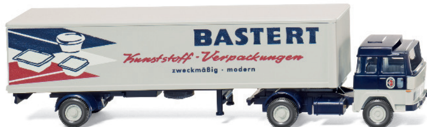
0547 01 Box semi-trailer (Magirus)