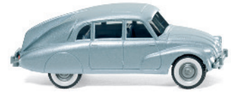
0827 49 Tatra 87