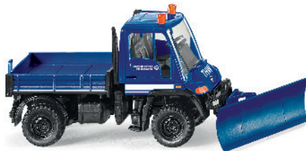
0693 22 THW - Unimog U 400 with grader blade