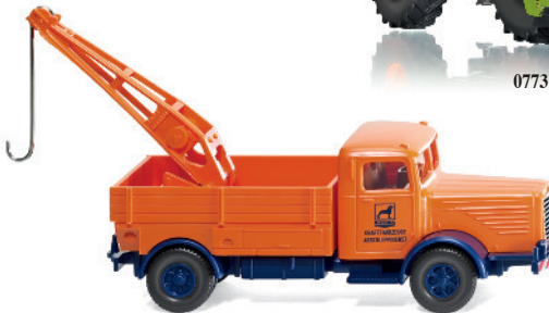
0634 02 Tow truck (Büssing 8000)