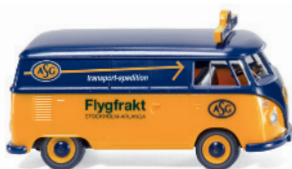
0797 13 VW T1 panel truck