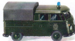
0864 19 Police vehicle - VW T1 twin cab with tarpaulin