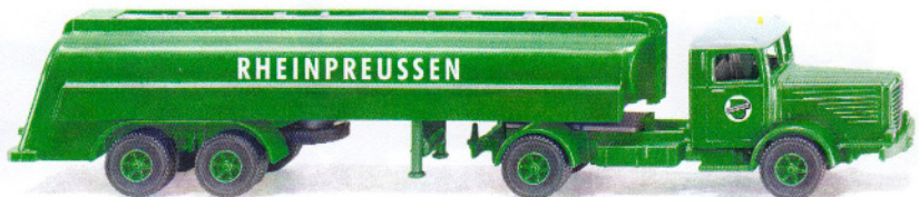
0882 49 Articulated tanker truck (Büssing 8000)

W IKING's model upgrades bring together four decades of automobile history and the eras are represented in all their facets in an exciting range of models. The Büssing 8000 articulated tanker truck joins the range in the livery of legendary petrol company "Rheinpreussen" while the Ford Lincoln Continental and the Mercedes Benz Pagode as seasoned chrome classics hark back to the 1960s.