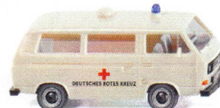
0320 02 German Red Cross - VW T3 van