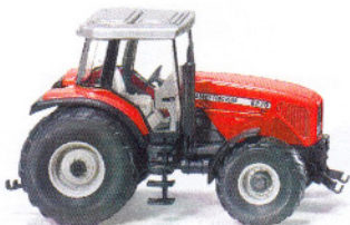
0385 05 Massey Ferguson MF 8270