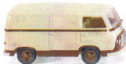
0289 01 Ford FK 1000 box van