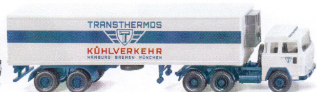
0528 49 Articulated truck with refrigerated trailer (Magirus 235 D)

Both are classics which are inextricably linked with the post-war history of Germany: WIKING's new models for August include the Glas Goggomobil with folding roof in filigree detail and the Ford FK 1000 as a box van. Thanks to the typical craftsmanship of WIKING, both of these new models display intricate detail and high-quality finishing. Other newcomers to the summer range include the Ford Granada as a police vehicle and the Magirus 235 D as