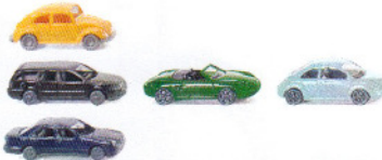
0918 08 Mixed set of 3 different cars N-gauge 1:160