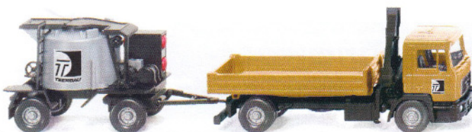
0689 03 Poured asphalt mixer truck-trailer combination (MAN F 90)