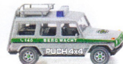
0278 03 Puch G