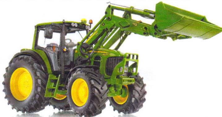
0773 09 John Deere 7430 with front loader