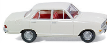
0790 01 28 Opel Kadett B saloon