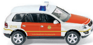
0601 17 33 Hamburg Fire Service - VW Touareg