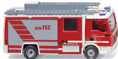
0614 02 38 LF 10/6 CL (MAN TGL) fire service vehicle