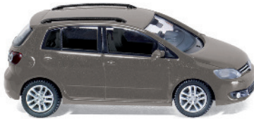
0075 01 31 VW Golf Plus