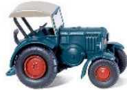
0951 40 27 Lanz Bulldog with roof - N-gauge 1:160