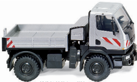
0369 01 33 Unimog U20