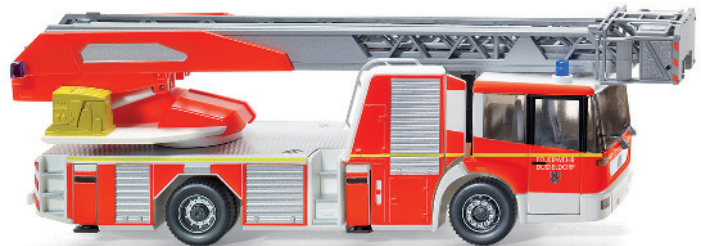
0627 02 44 Düsseldorf Fire Service - Metz DL 32 (MB Eonic)

Amongst its new models for August, WIKING has brought back the impressive Magirus KW 15 crane truck in the colours of the British Allies in Berlin. The truly historic model of the mighty Uranus which a lot of fire service enthusiasts have been asking for a long time is captivating due to the rarity of the original and the model's high level of authenticity. The emergency rescue vehicle with Metz turntable ladder used by the profes-