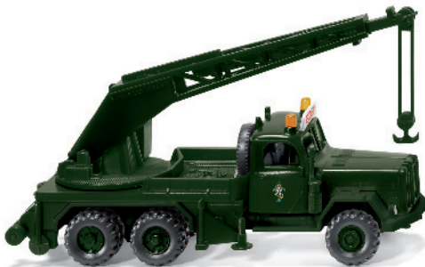
0696 23 33 Magirus Uranus KW 15