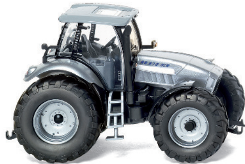
0362 39 32 Lamborghini