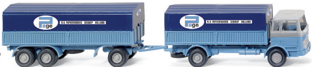
0410 01 Flatbed truck/trailer combination (MB LP 1620)