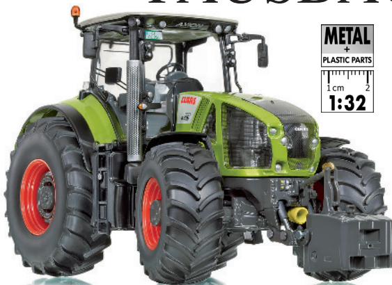
0773 14 Claas Axion 950