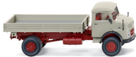
0895 04 Tipper truck (MB LAK 710)