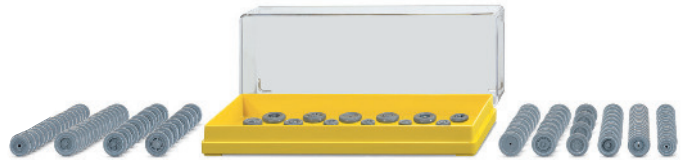
0018 06 Accessories set - Wheels