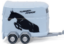
0066 04 Horsebox trailer