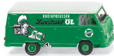
0270 47 Borgward B611 box van