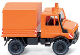
0374 02 Unimog U 1700 municipal vehicle