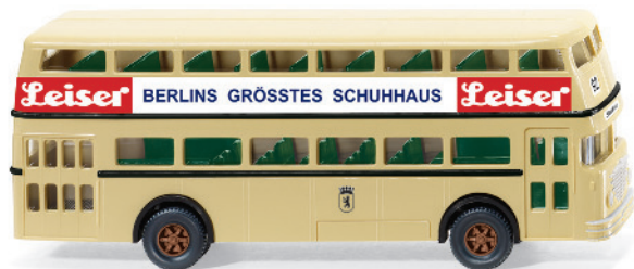
0722 03 D2U double-decker bus (Büssing)

W IKING has created a combination of youngtimers and time-tested classics that really look good together: in particular, fans of the brand will delight at the legendary covered parking area where they can line up their collection of historic WIKING models once again. The finished model was only ever available for a few years, as part of the range of accessories created by the traditional model-makers, before its moulds disappeared into the archives where they