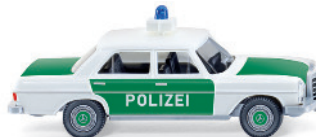
0864 24 Police vehicle - MB 200/8 saloon