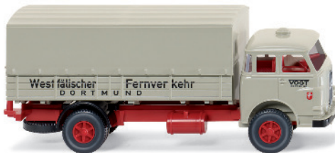
0416 01 Platform truck (MAN „Pausbacke“)