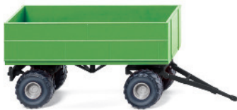
0388 39 Agricultural trailer