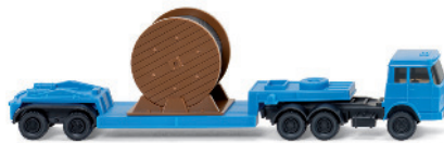
0949 40 Low-loader (Henschel) N-gauge 1:160

The legendary MAN “Pausbacke” is back! The classic truck stands alongside other contemporary vehicles such as the Audi 100 that appears for the first time in the form of a fire service special operations vehicle and the Mercedes Benz 200/8 as a public service vehicle for the police. WIKING’s new models also include the Glas 1700 GT as an extremely beautiful cabriolet and the Magirus