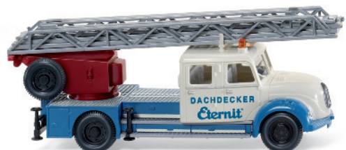
0862 35 Aerial lift truck (Magirus)