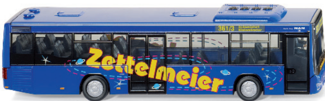
0707 02 MAN Lion's City A78