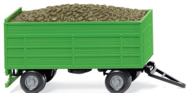
0388 15 Beet trailer