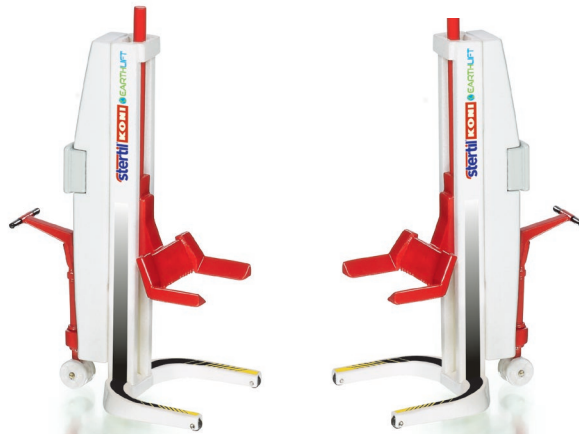
0778 45 Stertil Koni mobile column lift (content: 2 pieces)