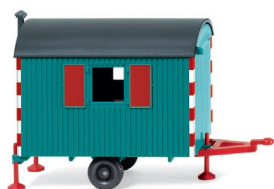
0656 07 Site trailer