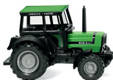
0386 02 Deutz-Fahr DX 4.70