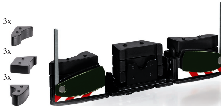
0778 44 AGRIBumper black