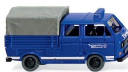
0293 07 THW - VW T3 crew cab