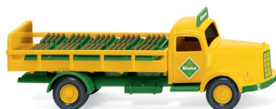
0570 02 Beverages truck (MB L 3500)