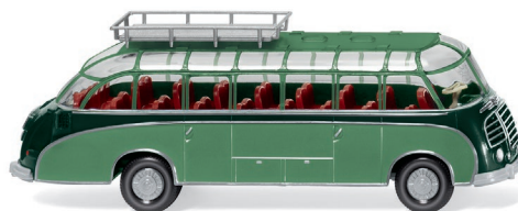
0730 02 Tour bus (Setra S8)