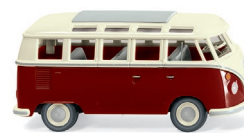
0797 22 VW T1 Samba bus