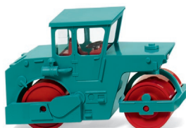
0650 05 Road roller (ABG)