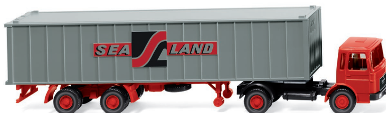
0523 04 Container semi-trailer (MAN)