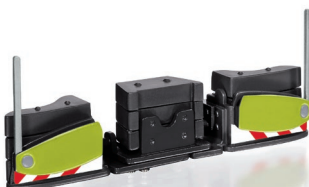
0778 41 AGRIBumper Claas Design