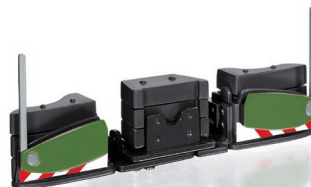
0778 42 AGRIBumper Fendt Design