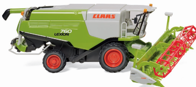
0389 14 Claas Lexion 760 combine harvester with V 1050 forager headers

To round off the end of the 2018 range, WIKING presents over five decades of model history. The VW Karmann Ghia Coupé appears in the range as a "yellow-black racer", along with the Glas Goggomobil and the Opel Caravan '57. WIKING has given the very traditional model trio of the 1950s and 1960s a sumptuous finish, with the Opel estate camper surprising with a two-colour design on the side and a contemporary roof rack. WIKING has also furnished the