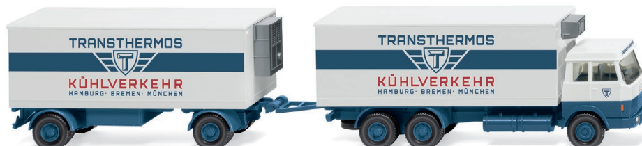
0440 01 Refrigerated road train (Hanomag Henschel)