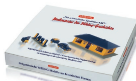
0990 94 "ASG" set

With its "pug" nose, the Tempo Matador developed a reliable name for itself in the early 1950s when it came to getting the economic miracle under way in the Federal Republic of Germany. The van from Hamburg was regarded as an allrounder and in its time, was a welcome ally in everyday traffic. Thanks to completely new moulds, WIKING has miniaturised the legendary Matador with a high degree of finesse, thus giving the new items in December a multifaceted appeal. Also making an appearance are the crew cabs of the VW T2 and VW T3 in the livery of THW. The VW Samba bus also joins the range of new items,