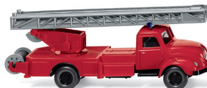
0620 02 Fire brigade – Turntable ladder (Magirus S 3500)