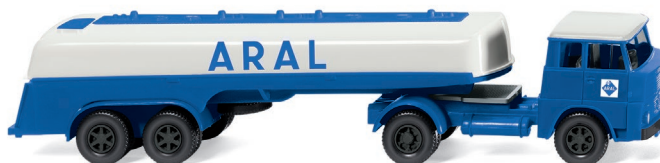
0806 98 Tanker truck (Henschel HS 14/16)