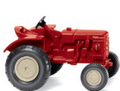
0877 05 Tractor