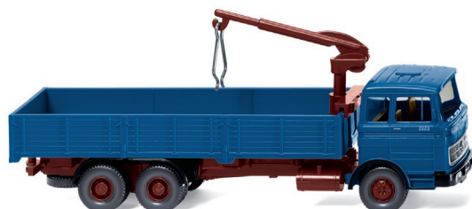
0433 07 High-sided flatbed truck (MB LP 2223)