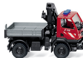
0601 31 Fire brigade – Unimog U 20 with loading crane