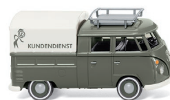
0789 05 VW T1 crew cab