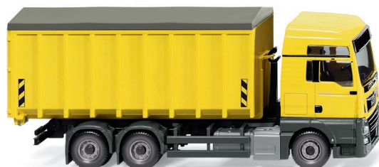
0672 05 Roll-off dump (MAN TGX EURO 6c/Meiller)