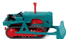
0844 37 Hanomag K55 crawler tractor