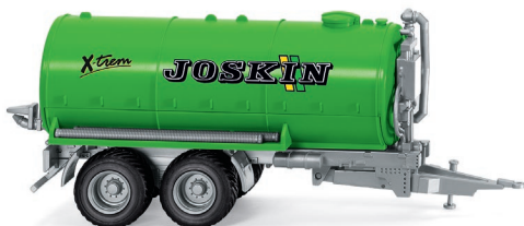
0382 38 Joskin vacuum barrel trailer