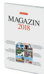
0006 25 WIKING-MAGAZINE 2018

The legendary Italian roadster has been immortalised as a WIKING model! With the design of the Alfa Spider, brain child of iconic designer Pininfarina, WIKING consciously prescribed a new design vocabulary – the details are intricately reproduced. The traditional model maker is also taking the wraps off a BMW 2002 in the service of the Free State of Bavaria, which faithfully replicates the look the Bavarian police gave their vehicles at the time. Also making their debut are the Mercedes-Benz LP 2223 as a high-sided flatbed truck with loading crane, the Krupp Ardelt sporting a scrap