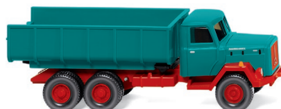
0645 03 Dump truck (Magirus)