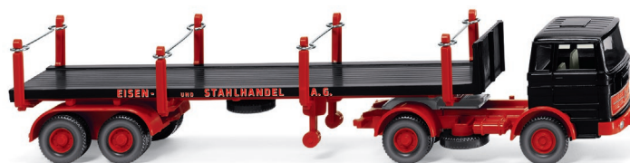
0518 45 Stanchion trailer truck (MB 1620)