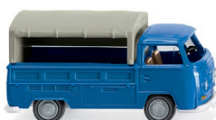
0316 03 VW T2 flatbed