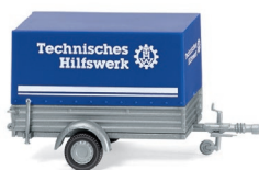
0056 04 THW - passenger vehicle trailer