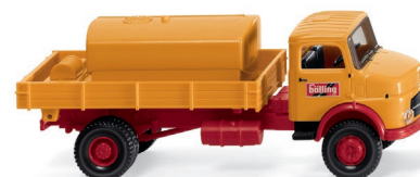
0438 02 Flatbed tipper with vehicle-mountable tank (MB LAK)