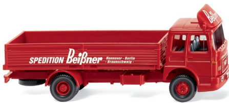
0519 02 Swap body truck (MAN)