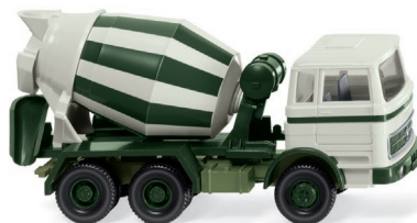
0682 03 Concrete mixer (MB 1620)