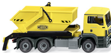
0679 06 Skip lorry (MAN TGS Euro 6/Meiller)