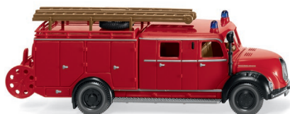
0863 99 Fire brigade - LF 16 (Magirus)