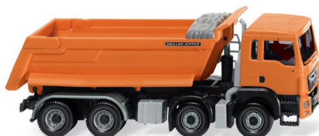
0674 48 Tipper trailer (MAN TGS Euro 6/Meiller)