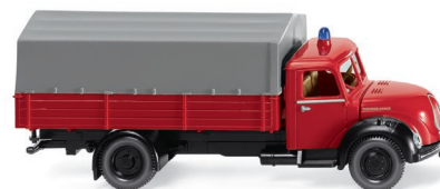
0861 43 Fire brigade - flatbed truck (Magirus)