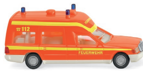
0607 01 Fire brigade – ambulance (MB Binz)