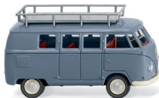
0788 10 VW T1 (type 2) bus