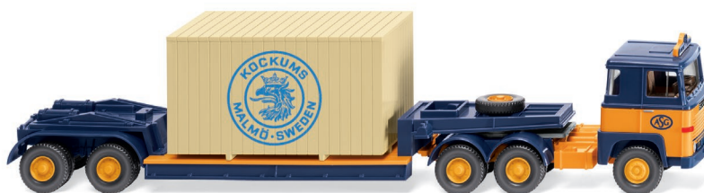
0503 04 Low-loader truck-trailer combination (Scania 111)

In the 1960s, it found a home in the hearts of professional fire departments as a figurehead – and now WIKING is presenting the legendary Magirus LF 16. The long group cab in particular makes the characterful fire truck very imposing – it also includes lengths of scaling ladder and an extending ladder on the roof, and a hose reel on the rear. And because in the history of the fire service, the Magirus round hood has never come on its own, WIKING is simultaneously releasing a multi-purpose truck that also has an "alligator" hood. The range is rounded off