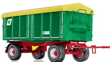
0778 27 Kröger HKD 302 two-axle three-way tipper