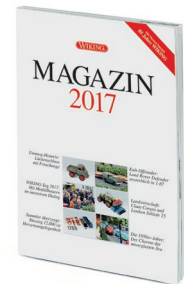
0006 24 WIKING-MAGAZIN 2017

W IKING creates themed fun: The traditional model makers have provided the new tipper trailer with a Meiller drop-off tipper on a MAN TSG chassis – the latest construction site range provides attractive accents! Not only that, the model upgrades cast a nostalgic look back at past decades of vehicle construction. And the Hanomag WD most of all, which marked the beginning of early motorisation of agriculture. The Mercedes-Benz 180 and DKW F 89 also make a return. The Volvo Amazon completes the set of model upgrades in a new livery. However, at the centre of the popular range of