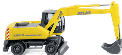
0661 03 Mobile excavator (Atlas 2205 M)