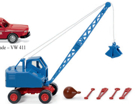
0662 01 Cable excavator (Fuchs F 301)