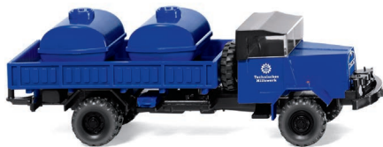
0693 28 THW - standby tanker (MAN)