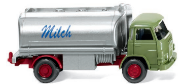
0807 48 Milk float (MAN 415)