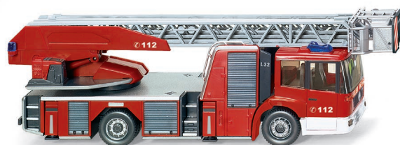
0627 04 Fire brigade - Metz DL 32 (MB Eonic)

Topicality on all 1:87 construction sites: The imposing Volvo wheel loader L 350F as well as the Atlas mobile excavator 2205 M join the programme. Both specialists achieve a high degree of model making original authenticity through fully functional loading movements. Moreover, fire brigade enthusiasts will be pleased with the Metz turntable ladder DL 32, which mounted on the low-floor chassis of the Mercedes-Benz Eonic is equipped for every rescue mission. The Unimog U 1300 is ready for winter service on the haulage premises of