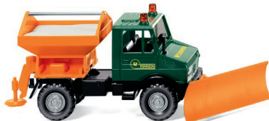
0646 08 Winter service - Unimog U 1300