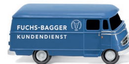
0265 03 Van (MB L 319)