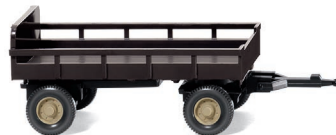
0869 03 Agricultural trailer