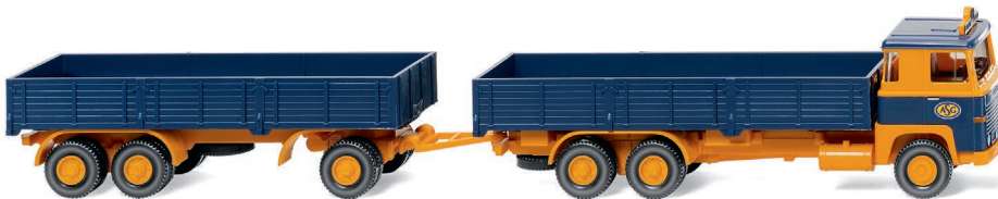
0433 04 Flat-bed road train (Scania 111)