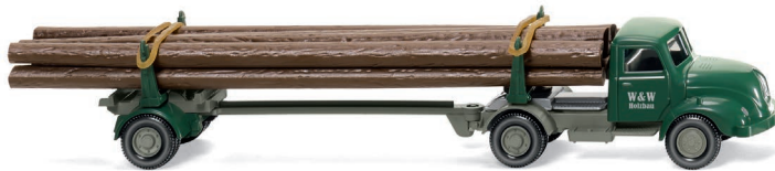
0390 10 Timber transporter (Magirus S 3500)