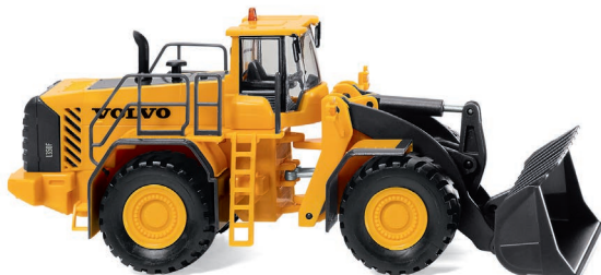
0652 02 Wheel loader (Volvo L 350F)