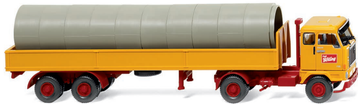
0515 01 Aluminium flat-bed lorry (Volvo F88)