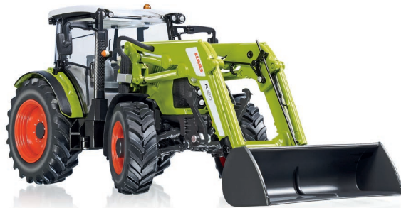
0778 29 Claas Arion 430 with front loader 120