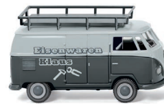
0788 03 VW T1 (Type 2) van