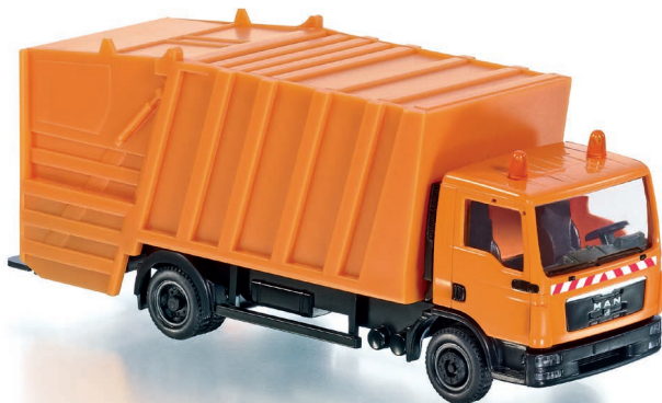
0774 29 Compactor garbage truck (MAN TGL)