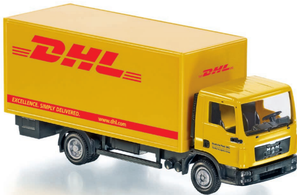
0774 27 Box truck (MAN TGL)