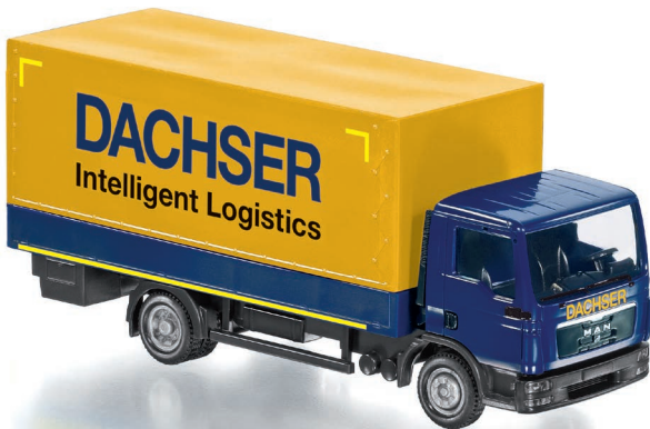
0774 28 Flatbed truck (MAN TGL)