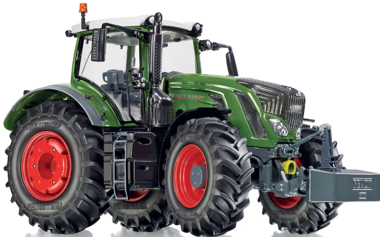
0773 43 Fendt 939 Vario (2014)

The Fendt 939 Vario represents design, aesthetics and model-building pleasure in details – WIKING gets to the heart of it with this 1:32 model! The traditional model makers miniaturize the top-of-the-range tractor, whose prototype will find its way into many big business farmyards. The Fendt 939 Vario is the flagship from Marktoberdorf; with its extremely powerful performance, it is exceedingly well-suited to the very heavy-duty tasks out on the field. WIKING places great emphasis on the finely detailed design of the cab and the interior. The same applies to the design of the engine and hood.