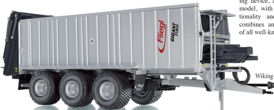
0773 22 Fliegl ASW 391 with spreader mechanism

The fully functional Fliegl Gigant ASW 391 push-off trailer is getting an additional function! Large-scale agriculture is really where the rear spreading device for the load has gained substantially in importance. WIKING has miniaturized the spreading device, and equally the complete model, with a high degree of functionality and mobility. The model combines and optimizes the benefits of all well-known transport systems.