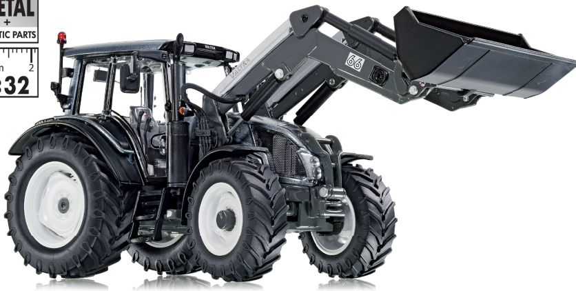
0773 27 Valtra N123 with front loader

In accordance with the role model of the Scandinavian tractor smiths, the Valtra N123 appears with an impressive front loader. Absolute loyalty to its role model awaits friends of the agricultural machine when they get their hands on this Valtra, which is in line with WIKING's quality philosophy. Even as a 1:32 miniature, the Valtra N123 stands for Scandinavian functionality in perfection. Numerous details make clear why the precision model is so fascinating: the cabin and the engine hood can be opened and the front loader can be moved into all positions.