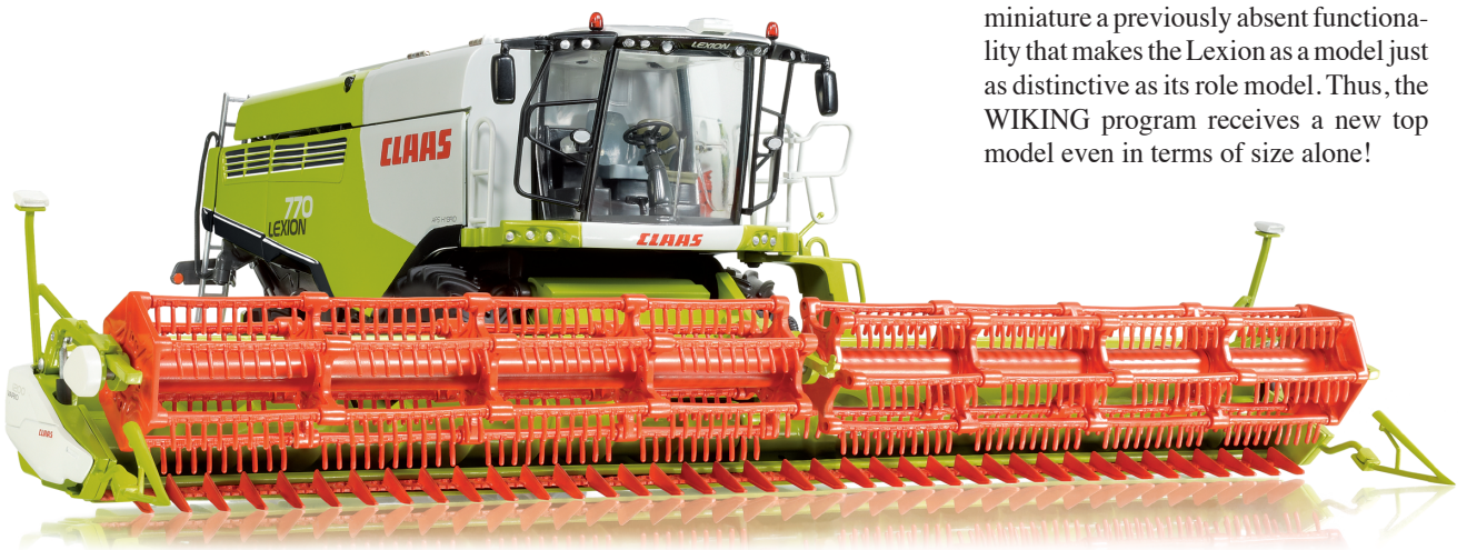
0773 29 Claas Lexion 770 harvester with V 1200 grain mower attachment

The surprise has come to fruition. For the first time, WIKING builds a 1:32 scale harvester! The precision giant of modelbuilding miniaturizes the Claas Lexion 770 with cutting unit V 1200. The powerful 1:32 miniature a previously absent functionality that makes the Lexion as a model just as distinctive as its role model. Thus, the WIKING program receives a new top model even in terms of size alone!