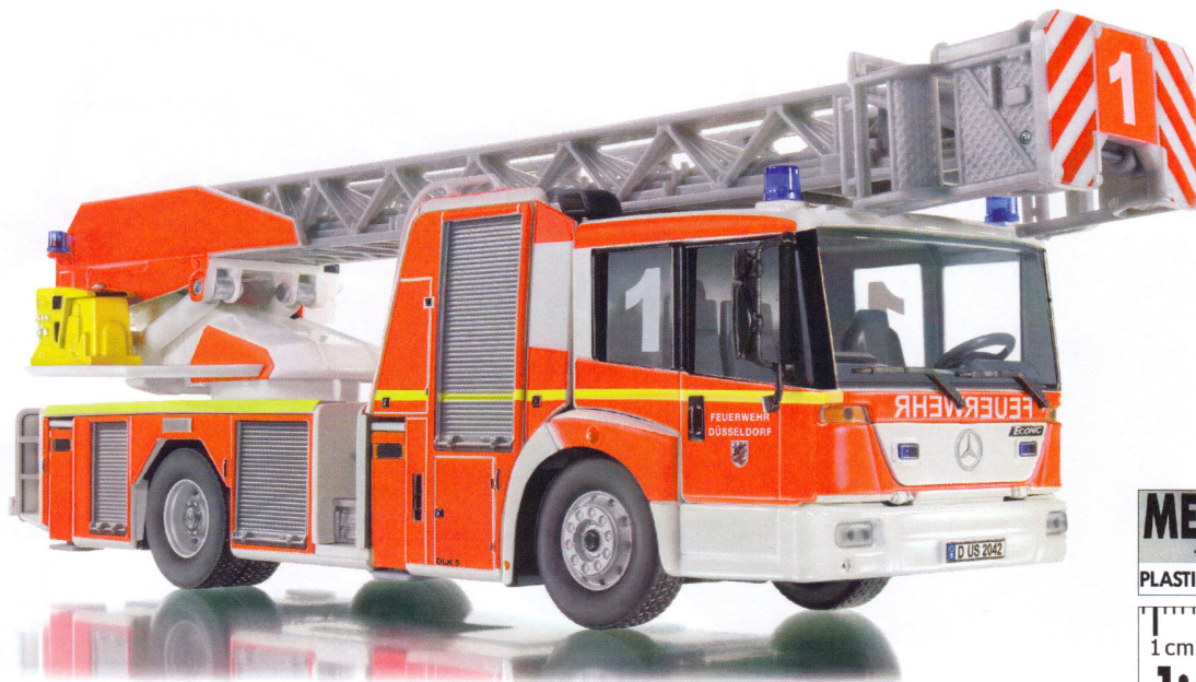
0431 02 Turntable ladder L32 (MB Eonic) fire truck