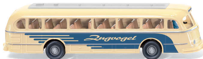
0700 01 Bus (MB O 6600 H Pullman)

This bus simply radiates that WIKING charm from the 1960s: along with the other model upgrades for February, the Mercedes-Benz O 6600 H Pullman has been fondly given a contemporary finish – the classic bus lives up to its name which translates as “migratory bird” and will de-finitely turn the heads of collectors. Beside it, the Lanz Bulldog makes a reappearance along with the enclosed Unimog U 411 and the legendary