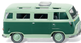
0289 99 Ford Transit Panorama bus