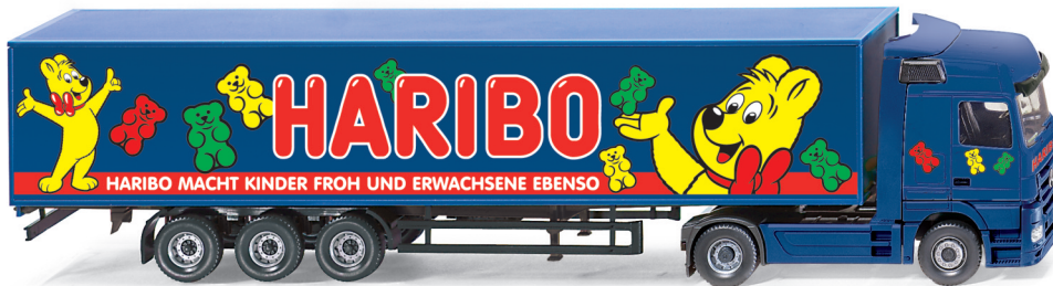
0538 15 (MB Actros) Semi-trailer truck