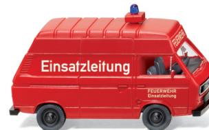
0601 21 VW T3 fire service