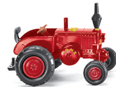
0880 04 Lanz Bulldog