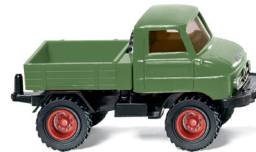
0371 03 Unimog U 411