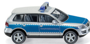
0104 43 VW Touareg GP "Explosive Ordnance Disposal"