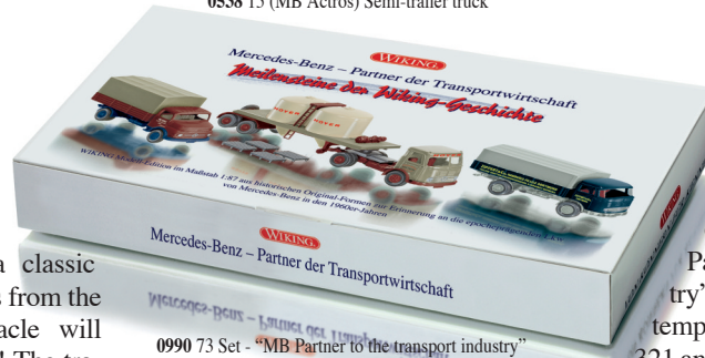
0990 73 Set - "MB Partner to the transport industry"

W IKING starts off the new model year with a classic offensive – automotive legends from the years of the economic miracle will delight 1:87 collectors in 2011! The traditional model-makers have created models of the original Goggomobil as well as the impressive Panorama version of the Ford Transit. WIKING's final member of the desirable trio of new models which will thrill so many fans of the brand is the Hanomag Diesel flatbed truck as all three models are classic vehicles which were once a common sight on the streets of the emerging