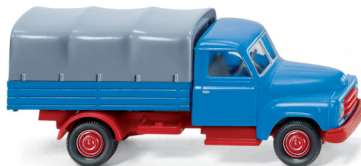
0345 01 (Hanomag Diesel) Flatbed truck vehicle