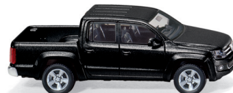
0311 02 VW Amarok