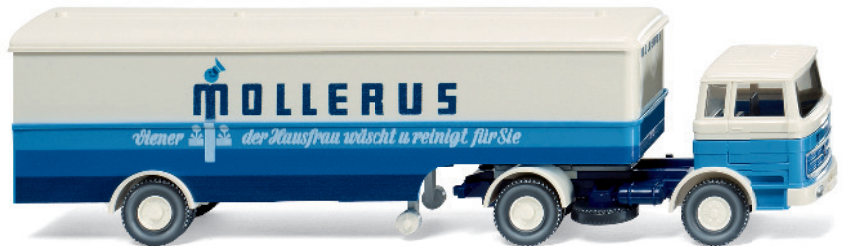
0513 18 Semi-trailer truck (MB 1620)