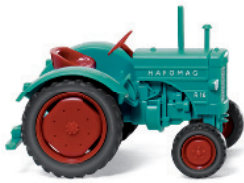
0885 05 Hanomag R 16