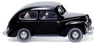
0820 03 Ford Taunus G73A