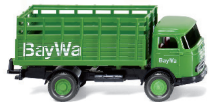
0446 03 Truck with lattice structure in the back (MB LP 321)