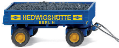
0400 01 Coal trailer