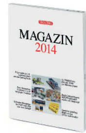
0006 21 WIKING "MAGAZIN 2014"

Beautiful classics – updating the range of models with lots of contemporary verve is what makes this possible! The VW "Bulli" of the first generation with a colorful flower power look is brought into the WIKING program – the "peace generation" of the late 1960s sends its love. The Mercedes-Benz 1413 as flatbed trailer in the colors of "Maschinenfabrik Esslingen" are just as much model fun as the Lanz Bulldog and coal trailer, which have been miniaturized, modeled on the historical prototypes of