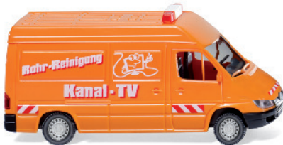
0283 02 Municipal service - MB Sprinter panel truck