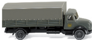
0949 03 Flatbed truck (Magirus) N-gauge 1:160

Beautiful classics – updating the range of models with lots of contemporary verve is what makes this possible! The VW "Bulli" of the first generation with a colorful flower power look is brought into the WIKING program – the "peace generation" of the late 1960s sends its love. The Mercedes-Benz 1413 as flatbed trailer in the colors of "Maschinenfabrik Esslingen" are just as much model fun as the Lanz Bulldog and coal trailer, which have been miniaturized, modeled on the historical prototypes of