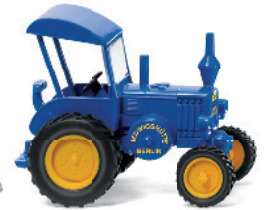
0880 07 Lanz Bulldog with roof