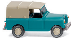
0100 02 Land Rover