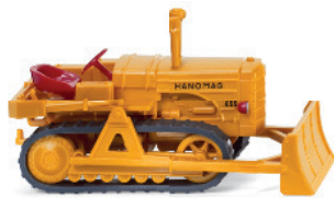
0844 38 Hanomag K55 bulldozer