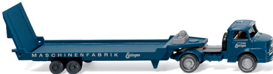
0490 01 Flatbed trailer (MB 1413)