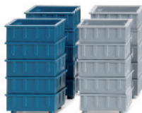
0018 12 Accessories package - stacking boxes