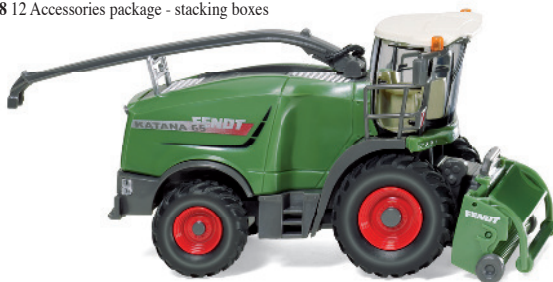
0389 60 Fendt Katana 65 with grass pick-up