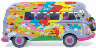
0797 14 VW T1 Bus