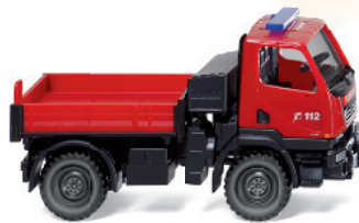
0601 25 Fire service - Unimog U 20