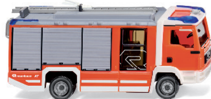
0612 49 Fire service Rosenbauer AT LF (MAN TGL)