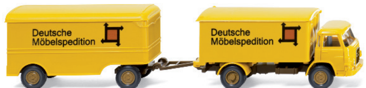
0540 03 Furniture trailer truck (MAN)