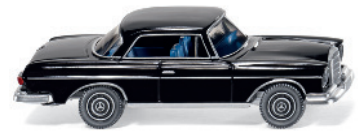
0146 03 MB 250 SE Coupé