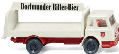
0560 01 Beverage truck (International Harvester)