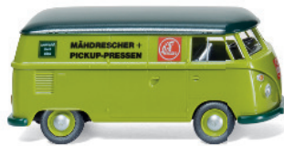
0797 11 VW T1 Box van