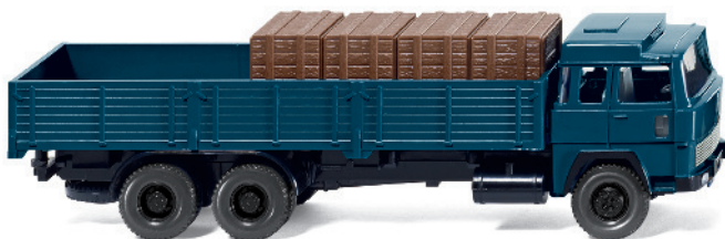
0433 02 High-sided flatbed truck (Magirus 235 D)