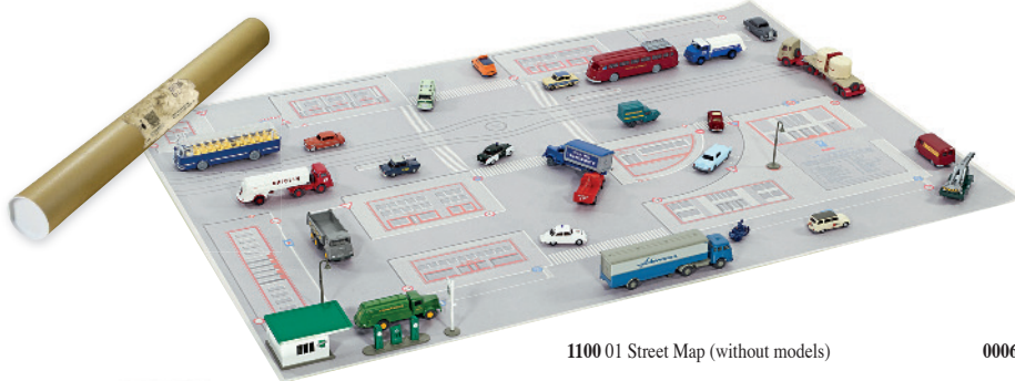
1100 01 Street Map (without models)