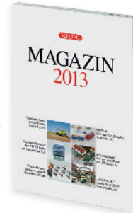
0006 20 WIKING-Magazine 2013