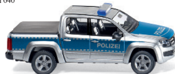
0311 06 Police - VW Amarok