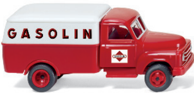
0345 48 Box truck (Hanomag L28)