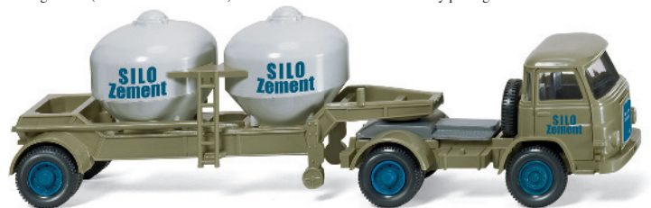
0530 01 Cement tractor trailer (MAN)