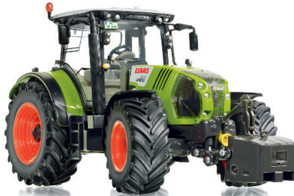
0773 24 Claas Arion 640