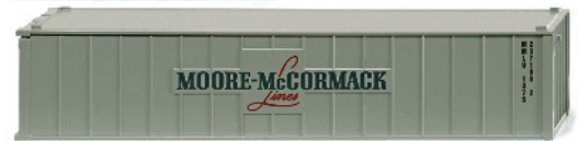
0018 09 Construction materials accessory pack - container