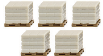
0018 08 Accessory package - Construction materials