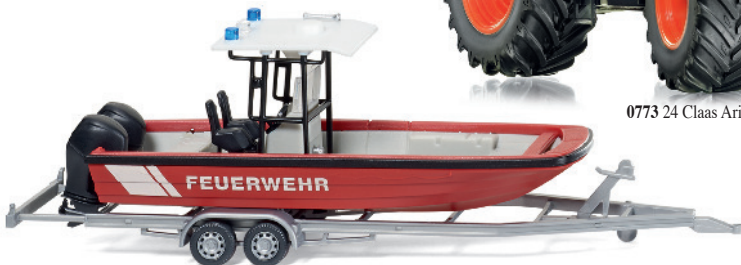
0095 47 Fire brigade - Multi-purpose boat MZB72 (Lehmar) with roof