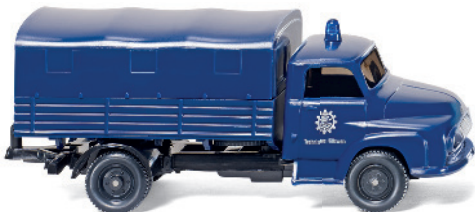
0693 20 THW - Flatbed truck (Ford FK 2500)