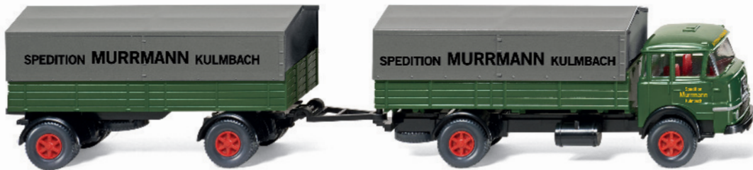
0486 01 Flatbed truck and trailer (Krupp 806)