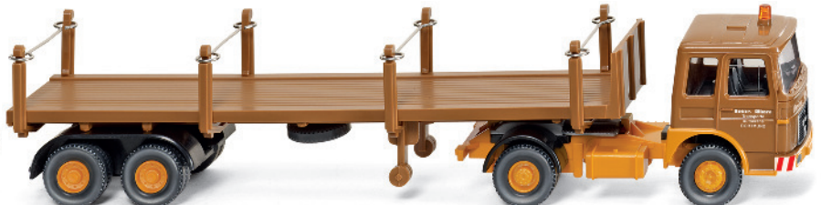
0518 49 Articulated truck with stanchions (MAN 19.230)