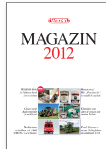
0006 19 WIKING MAGAZINE 2012