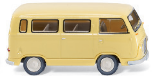
0289 49 Ford FK 1000 bus