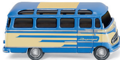
0260 01 Panorama bus (MB L 319)