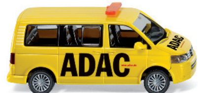
0078 12 ADAC - VW T5 GP Multivan