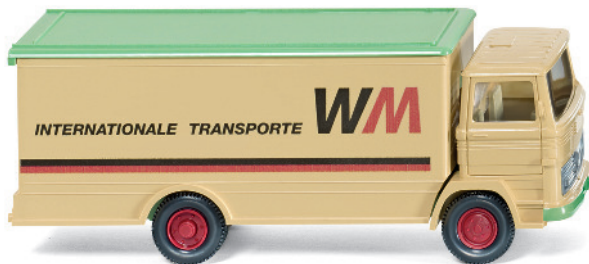
0436 01 Box truck (MB LP 1317)