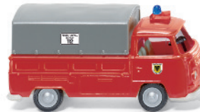
0861 21 Fire service - VW T2 flatbed truck