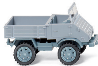
0870 05 Unimog U411 Swiss military vehicle