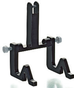
0773 87 Adapter coupling