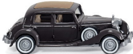
0832 03 MB 260 D