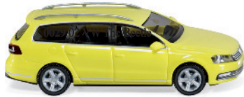
0089 02 VW Passat B7 Variant