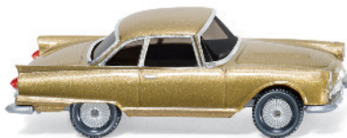
0128 01 DKW 1000 Special Sports coupé