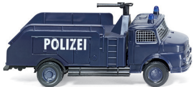
0864 27 Police vehicle - Water cannon truck (MB short-nose)

When it comes to the success of WIKING's model upgrades, it's all about the mix! A new ADAC vehicle joins the range in October in the form of the VW T5 Multivan. We also have the VW Passat B7 Variant in a fresh new up-to-date colour. Classic car enthusiasts will delight at the legendary DKW 1000 Special Sports coupé and the Mercedes-Benz L 319 Panorama bus. Other vehicles making