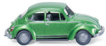
0795 04 VW Beetle 1303 „City“