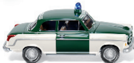
0864 28 Police vehicle - Borgward Isabella