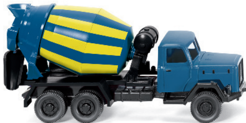
0682 01 Concrete mixer (Magirus Saturn)