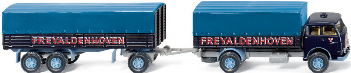
0416 02 Flatbed truck and trailer (MAN "Pausbacke")

There's a lot to look forward to this autumn with the launch of both classics and youngtimers – WIKING's new models for October really bring automotive history to life! The vehicles making an appearance include the Audi 50 and the Ford FK 1000 bus which have been created using new moulds, along with a model of the original Goggomobil which once graced the roads in the form of a fire service vehicle. Another vehicle