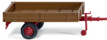
0887 39 Agricultural trailer (Fortuna)