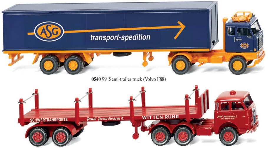
0518 47 Stanchion trailer truck (MAN Pausbacke)

0861 32 Fire service - (Henschel HS 100)