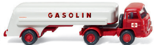
Models of set 0990 82 "Tankers from German everyday life"

W IKING has brought a touch of summer to the range – the aura of the classics is set to be a real breath of fresh air. Surprising additions among the new models available from specialist shops include the Ford Mustang Cabriolet in sunlight yellow along with the Audi 100 as a police patrol car and the 1939 Opel Blitz tanker in the form of a fire service pump water tender. Other vehicles making their debut include the Hanomag HD5N box truck as well as the Magirus-Deutz as a dumper truck with a