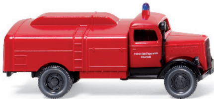
0861 23 Fire service vehicle - Tanker (Opel Blitz 1939)