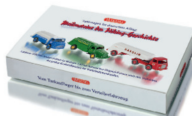
0990 82 Set of "Tankers from German everyday life"

W IKING has brought a touch of summer to the range – the aura of the classics is set to be a real breath of fresh air. Surprising additions among the new models available from specialist shops include the Ford Mustang Cabriolet in sunlight yellow along with the Audi 100 as a police patrol car and the 1939 Opel Blitz tanker in the form of a fire service pump water tender. Other vehicles making their debut include the Hanomag HD5N box truck as well as the Magirus-Deutz as a dumper truck with a