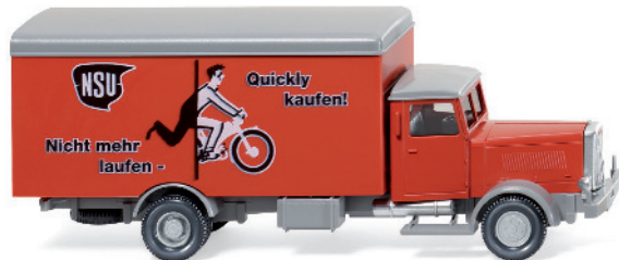
0846 01 Box truck (Hanomag HD5N)