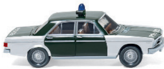
0864 32 Police vehicle - Audi 100