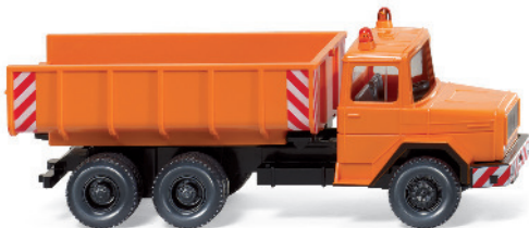
0645 01 Dumper truck (Magirus Deutz)