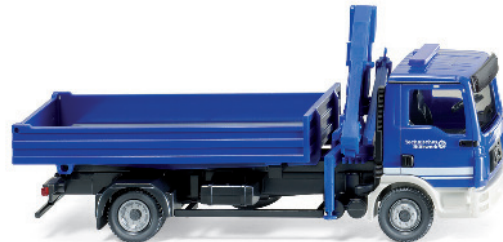
0693 19 TES - Flatbed truck with cargo crane (MANTGL)