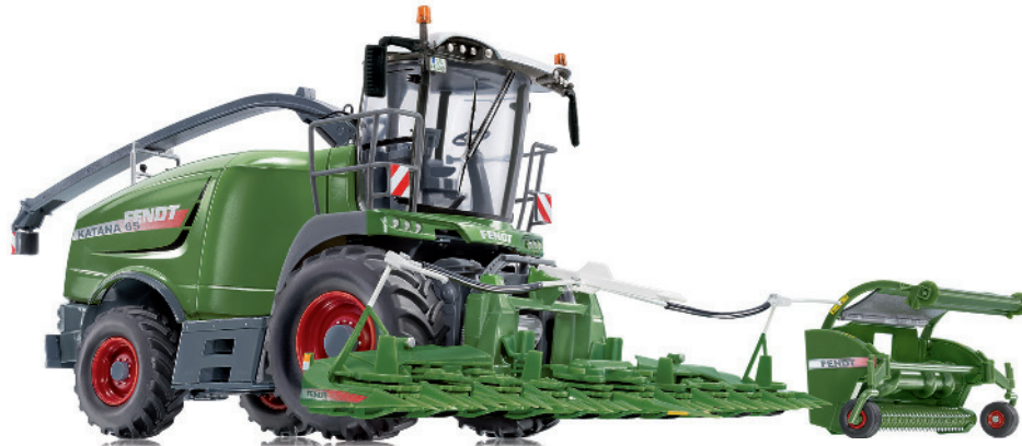
0773 15 Fendt Katana 65