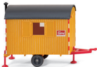
0656 05 Site caravan