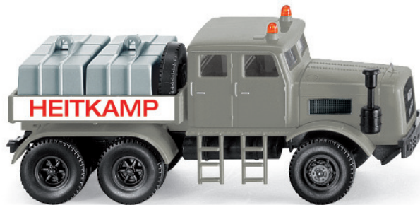
0851 35 Heavy-duty flatbed truck (Kaelble)

No other truck-trailer combination is more characteristic of the construction boom that took place during the Economic Miracle years than the Kaelble KDV 22 Z. WIKING has created a 1:87 model of the 300 hp powerhouse based on the original vehicle used by the Heitkamp construction company from Herne which was founded back in 1892. Alongside the construction vehicle sits the Ruthemeyer road roller in the same corporate livery. But that is not all: the traditional model-makers have included even more classics among the latest model upgrades such as the red VW Beetle 1200 as well as the legendary Goli 3-wheeler on its way round the contemporary wholesale market. The VW T1 crew