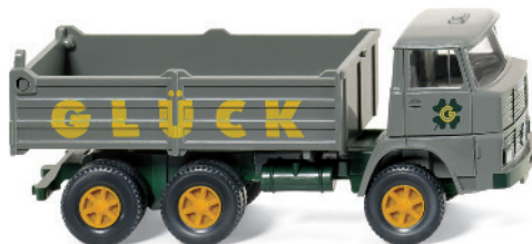
0673 06 High-sided dumper truck (Henschel)