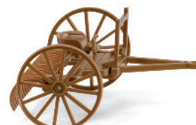
0889 03 Drag rake