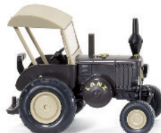
0880 05 Lanz Bulldog with roof