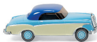
0144 21 MB 220 Coupé