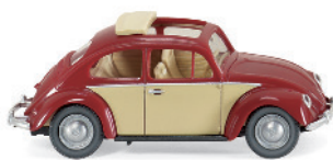
0794 36 VW Beetle 1200