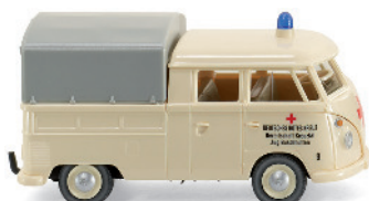
0865 03 DRK - VW T1 crew cab