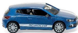
0073 03 VW Scirocco