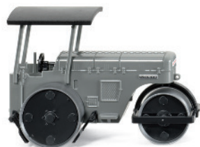
0898 03 Road roller (Ruthemeyer)