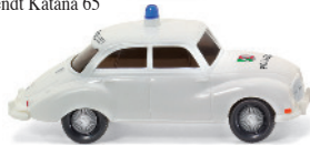
0864 25 Police vehicle - DKW 1000 saloon