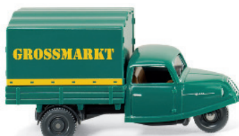
0841 09 DRK - Goli 3-wheeler