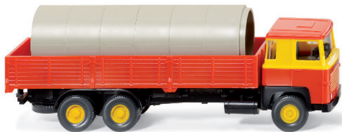
0433 01 High-sided flatbed truck (Scania 111 LBT)

A gricultural competence along with the intricate detailing characteristic of the model-makers at WIKING and the same level of functionality as the original - all combined within the latest model of the Fendt Katana 65 in 1:32. Then there are the new models joining the traditional 1:87 range which provide a contrast between the models of yesteryear and today: the ravishing Ford Mustang Cabriolet is the