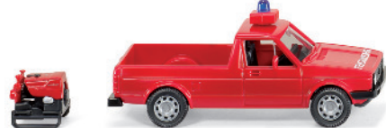
0601 23 Fire service vehicle - VW Caddy