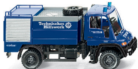
0693 17 THW - Unimog U 400 water tender (Rosenbauer)