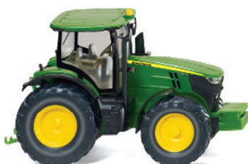
0358 01 John Deere 7260R