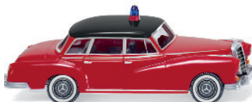
0861 25 Fire service vehicle - MB 300