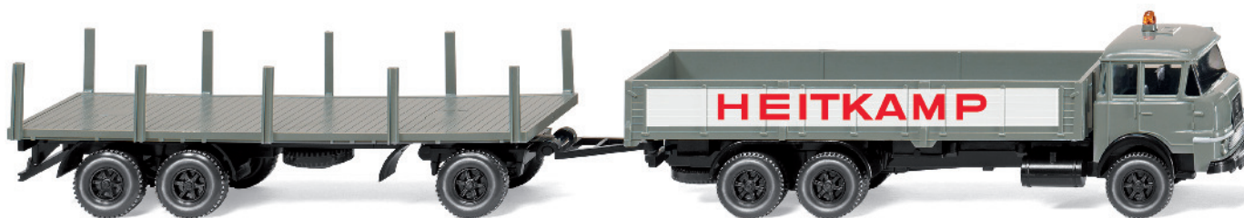
0502 01 Heavy truck and trailer (Krupp)

The VW Amarok was sold out in a few seconds after its model premiere; in due time for the winter, WIKING presents the filigree miniature of the cutting-edge pick-up from the Hanover VW production as a slightly modified model. The VW T5 GP as the postal delivery vehicle of the "Deutsche Post" represents the latest generation of the successful transporter in 1:87 scale. The Magirus Sirius as a dairy van