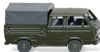
0293 02 Army - VW T3 crew cab