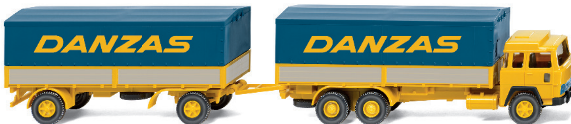
0475 01 Platform trailer truck (Magirus 235 D)