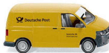
0309 06 VW T5 GP van