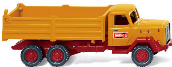
0424 02 High-sided tip truck (Magirus Saturn)