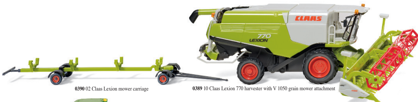
0390 02 Claas Lexion mower carriage