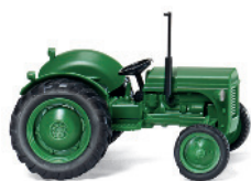
0892 04 Ferguson TE