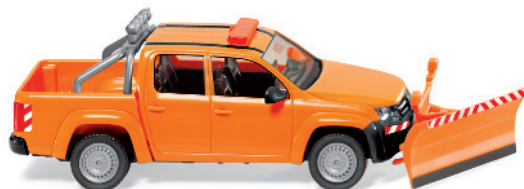
0311 07 VW Amarok - winter service