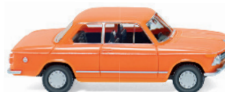
0183 01 BMW 2002