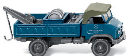
0366 01 Breakdown truck (Unimog S)