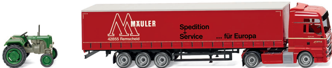
0876 48 Steyr 80