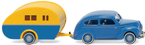
0820 04 Ford Taunus G73A with trailer