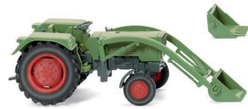
0890 03 Fendt Farmer 2S with front loader