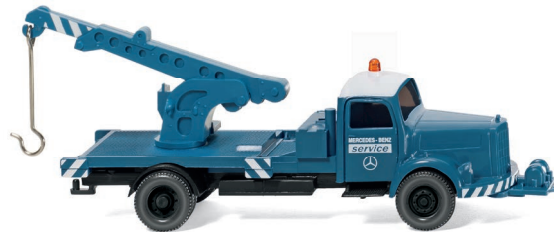
0421 01 Mobile crane (MB L 3500)