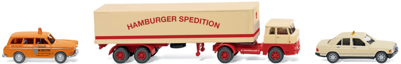
0042 01 Emergency service – VW 1600 Variant