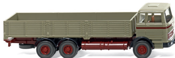
0433 03 High-sided flatbed truck (MB)

In 1:87 scale, a reunion takes place with such beautiful classics as the legendary Mercedes-Benz C 111 as well as the Mercedes-Benz L 3500 as service crane truck. The VW T1 appears in the former colors of the Henschel customer service. The Mercedes-Benz with a cube-shaped cabin and high-sided flatbed extends the range of the WIKING miniatures as does the