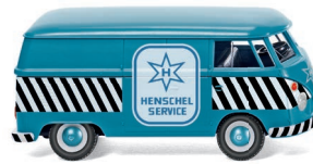
0797 16 VW T1 panel truck