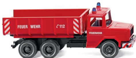
0624 02 Fire service - dumper truck (Magirus Deutz)