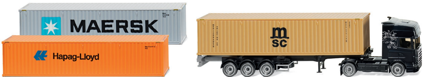
0018 13 Accessories package – 40' container (NG)