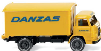
0540 04 Box truck (MAN 415)