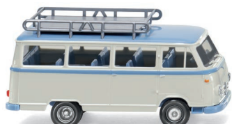
0270 98 Borgward Bus B611