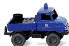
0693 24 THW - Unimog U 411