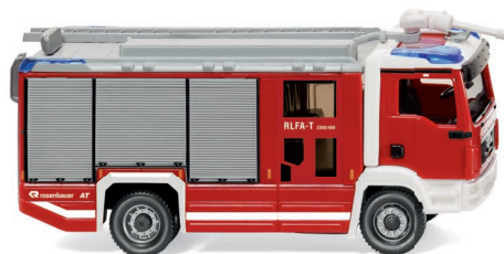
0612 48 Fire service - Rosenbauer AT RLFA-T (MAN TGM)