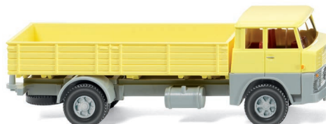
0412 01 Flatbed truck (Henschel HS 14/16)