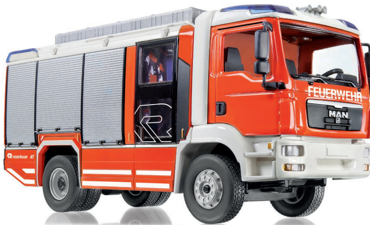
0431 42 Fire service - Rosenbauer AT (MAN TGM)