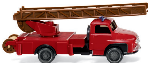
0620 01 Fire service - fire ladder truck (Ford FK 2500)