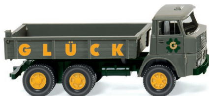
0424 03 Flatbed dumper (Henschel)