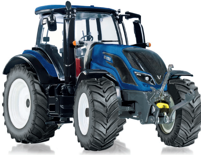
0778 14 Valtra T214