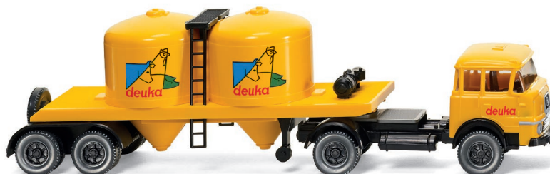
0534 02 Fodder tractor-trailer (Krupp)

It's the mixture of vehicles that does the trick – WIKING presents a plethora of themes! This time, revitalized forms take center stage. Almost five decades after their creation, they allow for many attractive new models. The model variety of the April range starts with the radiantly yellow Krupp as the "Deuka" fodder tractor-trailer that brings back some of rural aura of the 1960s. With a fine finishing and a roof rack, the Borgward Bus B611 is all set to take to the road. And new