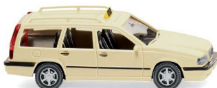
0800 12 Taxi - Volvo 850 station wagon