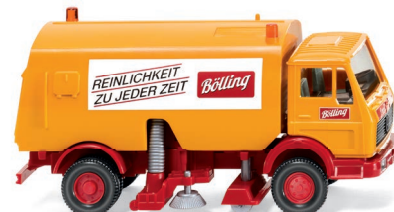
0642 05 Street sweeper (MB)