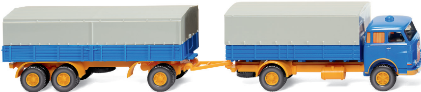
0416 04 Platform trailer truck (MAN Pausbacke) Classic cab-over-engine combination 1960-67