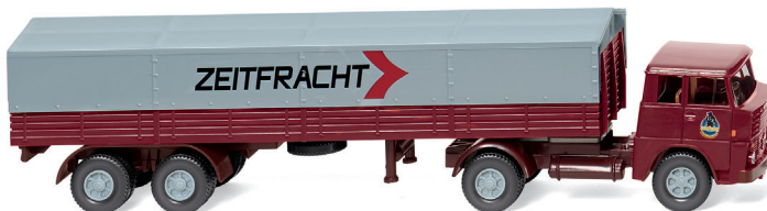
0514 07 Flatbed tractor-trailer (Henschel) Loyal Henschel customer of the 1960s 1961-65