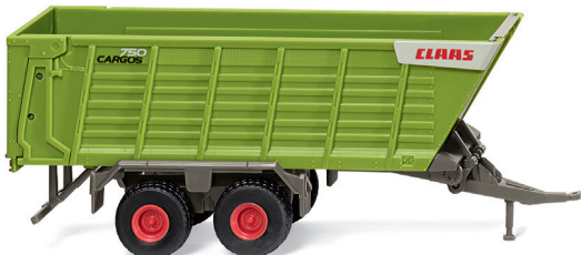
0381 98 Claas Cargos forage trailer Version as a chaff transport wagon with road tyres