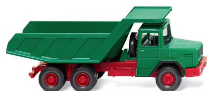
0990 99 Set „Magirus Baubullen“ Trio of the last square hood generation from Ulm 1970-74