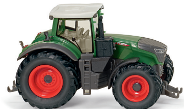
0361 64 Fendt 1050 Vario The latest version of the Allgäu-made tractor