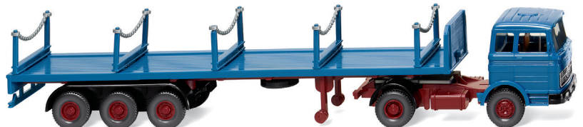
0554 06 Stanchion trailer truck (MB) Long-goods hauling in Mercedes blue 1968-71