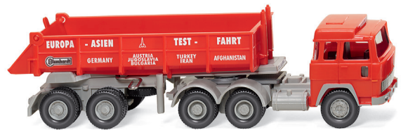
0677 08 Rear tipper semi-truck (Magirus 235 D) 7,018 kilometre test drive from Munich to Kabul 1963-71