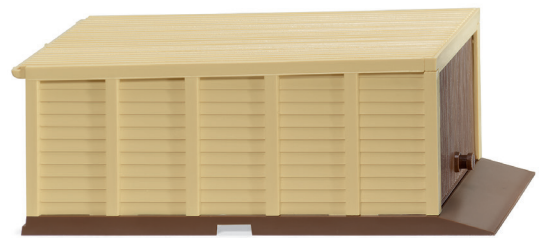
1140 03 Self-build garage (3S) True-to-the-original prefabricated model of the sixties since 1967