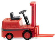
1171 02 Forklift truck (Clark) Pioneer in inventory turnover 1952-56