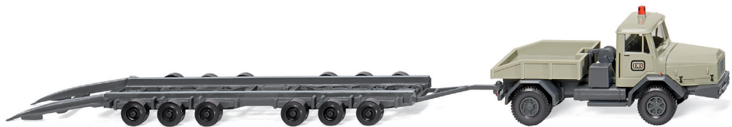
0493 01 Wagon-carrying road trailer Culemeyer (Faun) Imposing bonnet truck of the federal railway 1965-77