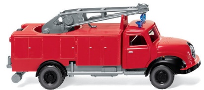
0623 04 Fire brigade rescue vehicle (Magirus) Round hood designed to provide technical assistance 1956-61