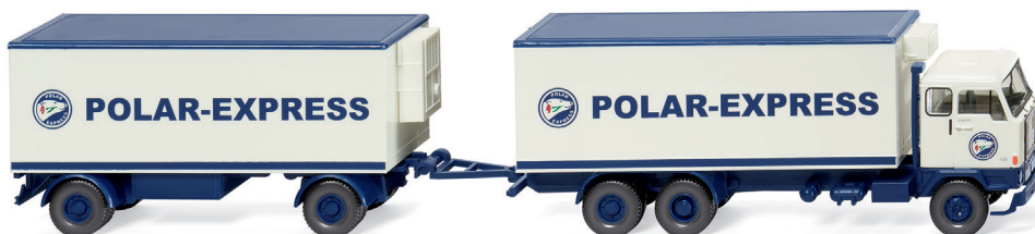
0457 04 Refrigerated road train (Volvo F88) Finland – Italy 2 times a week 1965-70