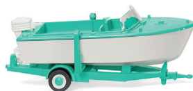
0095 03 Trailer-mounted motor boat The upscale way to spend your days off 1961-65