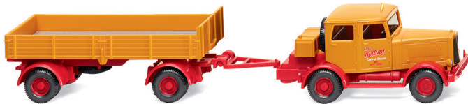
0850 48 Hanomag with flatbed trailer Favoured collector cycle modelled after Ruhr region originals 1946-52