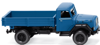
0424 99 Flatbed tipper (Magirus) Agile construction site square hood from new moulds 1962-68