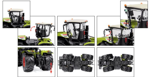
0778 53 Claas Xerion 4500 wheel drive Heavy loads lightened for the farmer