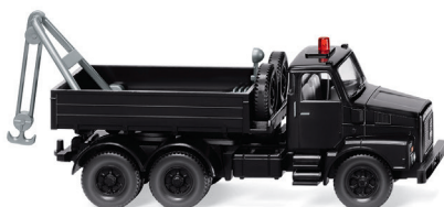
0634 09 Towing vehicle (Volvo N10) Early WIKING draft produced in volume for the first time 1973-85