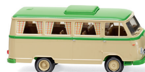
0270 44 Borgward camper van B611 Camper classic of the Economic Miracle era 1957-61