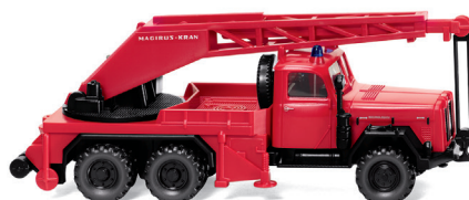
0861 49 Fire brigade-crane truck KW 15 (Magirus Uranus) Heavy-duty giant serving fire brigade professionals 1957-71