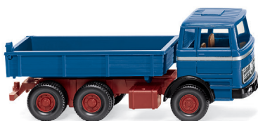
0424 07 Flatbed tipper (MB) Cubic modern classic operating at the construction site 1971-74