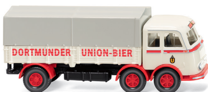
0429 03 Flatbed truck (MB LP 333) Long-distance beer transporter from Dortmund 1958-61