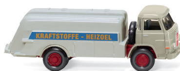
0781 02 Tanker (MAN) Première of the heating oil tanker of the sixties 1960-67