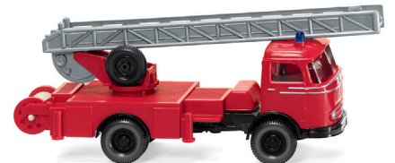
0861 48 Fire brigade- turntable ladder (MB) Rare cab-over-engine with turntable ladder 1957-69