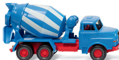
0682 08 Concrete mixer (MAN) Construction site bonnet truck with an impressive appearance 1969-94