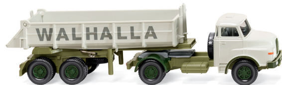
0677 07 Rear tipper semi-truck (MAN) On its way from the quarry to the lime works 1969-94