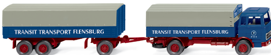
0432 03 Flatbed road train (MB) Logistics modern classic from Northern Germany 1972-73