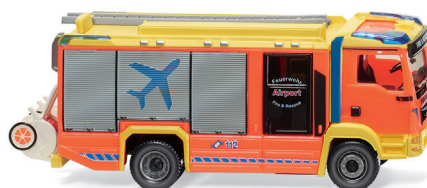
0612 43 Fire brigade – AT LF (MAN TGM Euro 6/Rosenbauer) Fire engine for the airport fire brigade