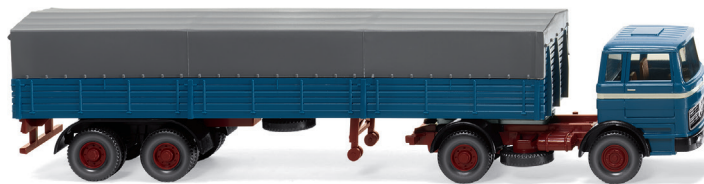
0514 05 Flatbed truck (MB) Long-haul freight traffic in the 1970s 1968-74