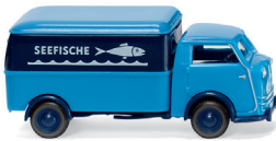
0335 06 Tempo Matador Box van Freshly caught and delivered 1949-52