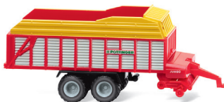
0956 02 Pöttinger Forage trailer N-gauge 1:160 Transporter for cutting-edge tractor combinations