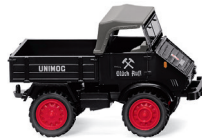
0870 67 Unimog U 411 Mining vehicle with all-wheel drive 1950-51