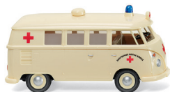
0797 29 VW T1 Bus Former standard ambulance of local emergency services 1963-67