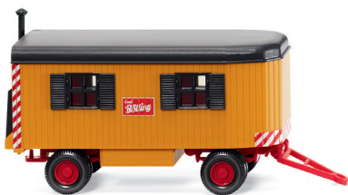
0656 08 Construction site trailer Construction yard classic from the Ruhr region 1961-79