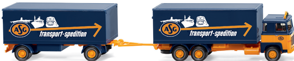
0457 03 Box trailer road train (Scania 111) Modern classic of Sweden's legendary forwarder 1974-80