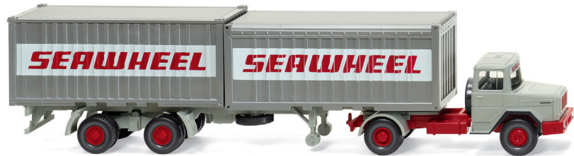
0524 02 Container semi-truck (Magirus Deutz) Square hood in action at the harbour 1970-74