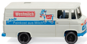
0270 58 MB L 406 Box van Milk deliveries in the west 1967-74