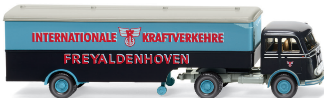
0513 24 Box semi-trailer (MB Pullman) Fixed-time deliveries and scheduled service 1955-63