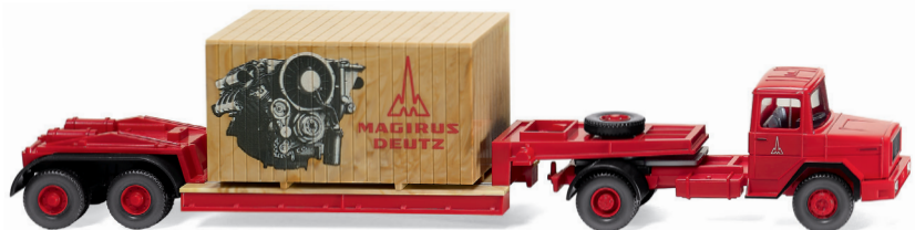
0503 05 Low-loader truck-trailer (Magirus Deutz) Deutz engines to all corners of the world 1970-74