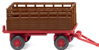
0384 04 Agricultural trailer Reinforcement for the harvest 1964-78