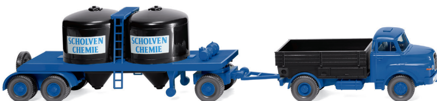
0534 04 Chemical trailer train (MAN) Transports at the chemical plant 1969-94