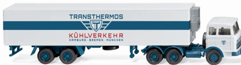
0543 02 Refrigerated semi-trailer (MB) Refrigerated transports with a new radiator grille 1963-67