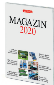
0006 27 WIKING MAGAZINE 2020 Annual reading for model passion