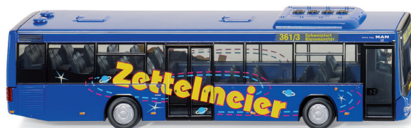
0707 02 MAN Lion's City A78