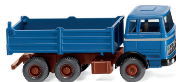
0673 09 High-side tipper (MB) First cubic model in the tipper business 1963-67