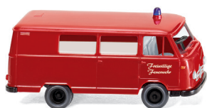
0861 17 Fire brigade – KTW (Borgward B 611)