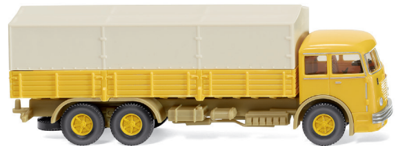
0479 04 Flatbed lorry (Büssing 12.000) Underfloor giant with a new colour scheme 1951-54