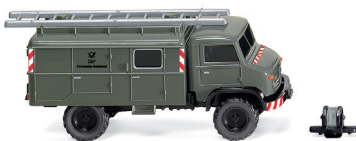
0360 02 Unimog S 404 Make connections with Unimog 1955-80