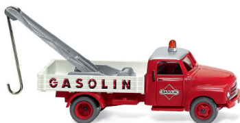
0352 02 Towing vehicle (Opel Blitz) Helper for the petrol station tenant 1952-60