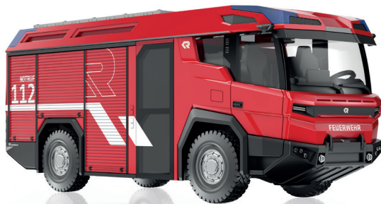
0431 10 Fire brigade – Rosenbauer RT The latest from the market leader