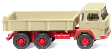
0424 05 Flatbed tipper (Magirus) All-wheel drive for the toughest jobs 1963-73