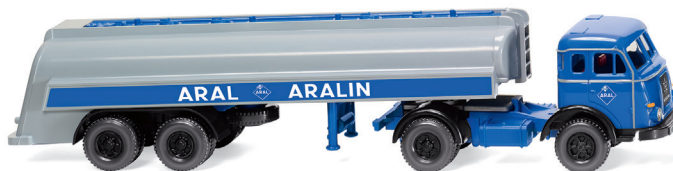
0882 47 Articulated tanker truck (Henschel) Typical Aral-tanker truck 1955-61