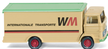
0436 01 Box truck (MB LP 1317)