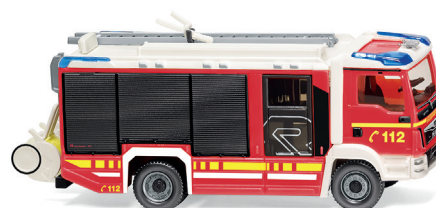
0612 44 Fire brigade – AT LF (MAN TGM Euro 6/Rosenbauer) New model combination of this all-rounder