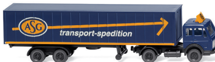
0950 03 Container tractor-trailer (MB) N-gauge 1:160 ASG in N-gauge 1989-94