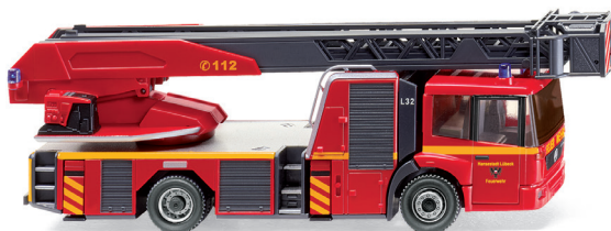
0627 03 Fire brigade Lübeck – Metz DL 32 (MB Econic)