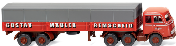
0488 04 Flatbed tractor-trailer (MB LPS 333) Millipede hauling for Mäuler 1958-61