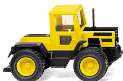
0385 97 MB Trac All-wheel drive from Gaggenau 1975-80