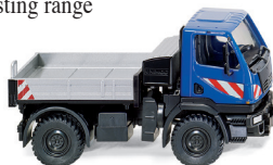
0369 02 Unimog U 20