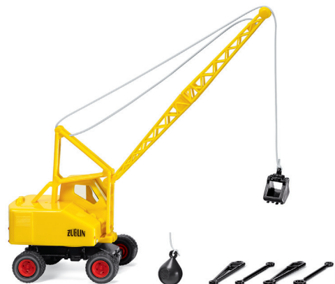
0662 05 Cable excavator (Fuchs F 301) With new high jib storage 1959-70