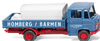
0271 02 Flatbed truck with demountable tank (MB L 408) Heating oil for small consumers 1967-71