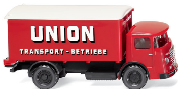
0476 03 Box lorry (Büssing 4500) Début as a box model 1953-55