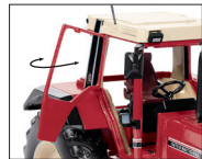
0778 52 IHC 1455 XL The cult tractor in large-scale