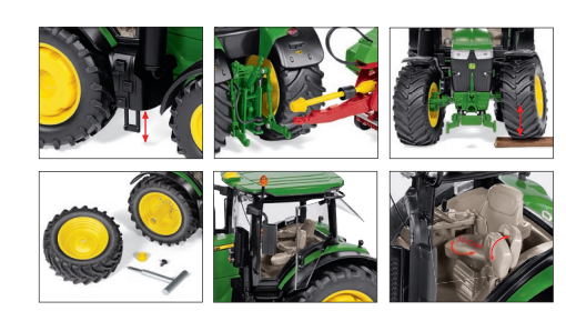
0778 46 John Deere 7310R with twin tyres