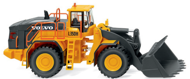
0652 10 Wheel loader (Volvo L350H)

he Volvo wheel loader is claiming all attention at 1:87 construction site with its strong, not to say brawny, build. WIKING has miniaturised the latest L350H generation with unmatched attention to detail. Among its stand-out features are the intricate attachments including a ladder and railing, which highlight the imposing size right behind the bucket. Its stunning magnitude comes even more to the fore when contrasted side by side with Neuson's Track Dumper 15 – two construction site powerhouses of opposite size. The