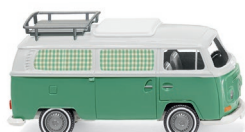
0315 02 VW T2 camper van