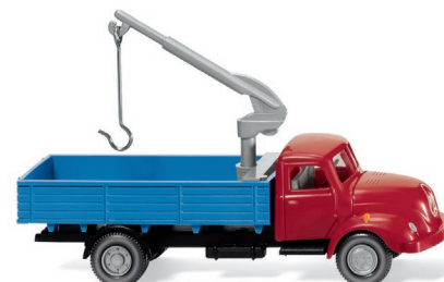
0420 02 Flatbed-truck with loading crane (Magirus S 3500)