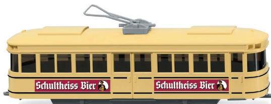
0750 01 Tramcar