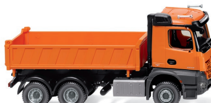
0678 48 Three-way tipper (MB Arocs)