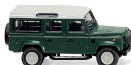
0102 02 Land Rover Defender 110