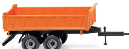
0678 04 Three-way tipper trailer