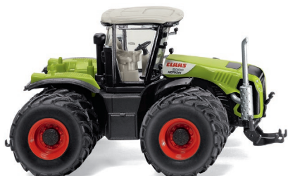
0363 98 Claas Xerion 5000 with twin tyres