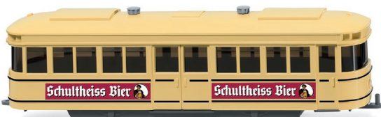
0749 01 Tram carriage