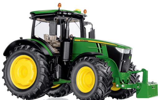
0778 37 John Deere 7310R