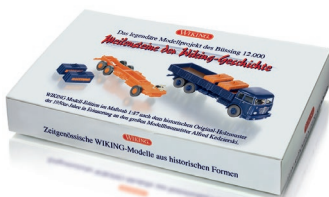
0990 93 Set "Büssing 12.000"

Experience living history on 1:87 scale! The Büssing 12.000 covered many kilometres in the early 1950s in the livery of the "Braunschweig" truck manufacturer in order to test road handling on long-distance journeys. Now WIKING has granted the historic test vehicle a special themed edition, which also includes the chassis that at the time was only supplied to that superstructure manufacturer, along with the corresponding Büssing ballast weights for the test vehicle. A matching cargo set in coordinating colours is also available. Not only that, WIKING has achieved a bridge to the times by bringing back to life the