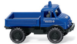
0693 29 THW – Unimog U 406