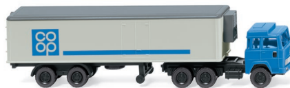
0951 99 Refrigerated semi-trailer (Magirus) N-gauge 1:160

Attractive scale contrasts à la WIKING! The Fendt 1050 Vario appears with impressive twin tyres on both a 1:87 and 1:32 scale – the charm of the models could hardly be more apparent. Anyone who values the 1:32 precision scale will be impressed by the 116 CS Claas Commandor with C660 forager headers. The combine harvester is the largest harvest time modern classic of the 1990s and extends the WIKING 1:32 scale agricultural range to include a retrospective. Of course, the new collection year kicks off with other new