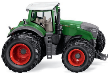
0361 62 Fendt 1050 Vario with twin tyres