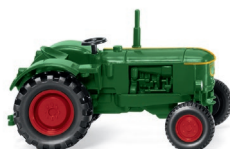
0881 03 Deutz D 40 L