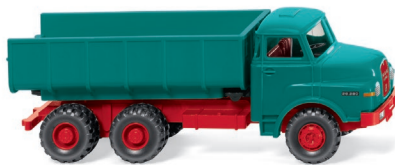
0645 02 Dump truck (MAN)