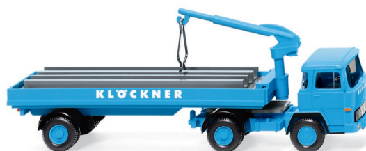
0502 05 Construction materials vehicle (Magirus 135 D 11 FS)

M ultifaceted look back at the golden area of WIKING classics! From old moulds, the traditional model makers are revitalising the sporty Porsche 356 convertible, the elegant DKW Limousine and the Unimog S as the fire engine of those days. In the authentic appearance for the time it was produced, the Ford Continental in bicolour design enters the range – the pastel colours of the paintwork against the white, folded back roof evoking the golden era of the impressive USA coupés. The intricately decorated VW T1 (type 2) appears in a "Dujardin" branded design and WIKING has given the large type D 40 L Deutz tractor a modest ornamental