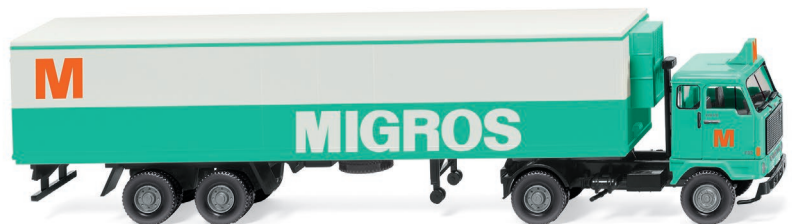
0543 01 Refrigerated semi-trailer (Volvo F89)