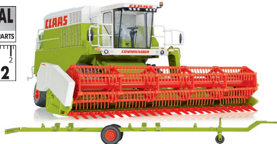
0778 34 Claas Commandor 116 CS combine harvester