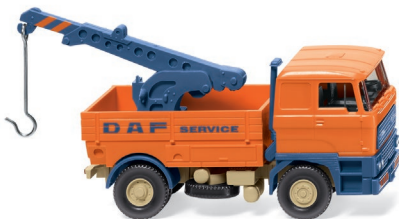
0634 04 Towing vehicle (DAF)