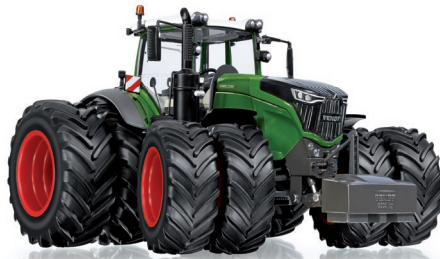
0778 30 Fendt 1050 Vario with twin tyres