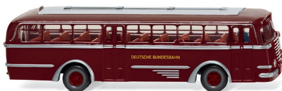
0720 02 Büssing Trambus