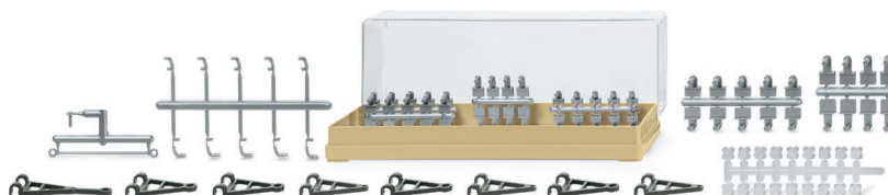
0018 18 Accessory pack – connections II