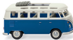
0797 21 VW T1 Samba bus