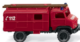
0601 29 Fire brigade – Unimog S