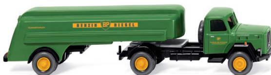
0800 48 Tanker truck (Magirus Saturn)