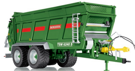
0778 35 Bergmann TSW 6240 S universal spreader