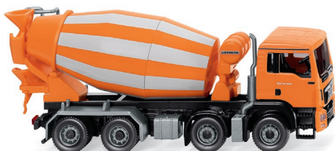
0681 48 Concrete mixer (MAN TGS Euro 6/Liebherr)