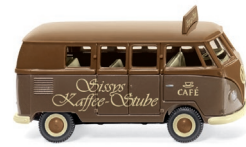
0788 08 VW T1 (type 2) bus