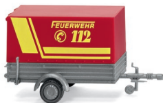
0056 05 Fire brigade - Passenger vehicle trailer