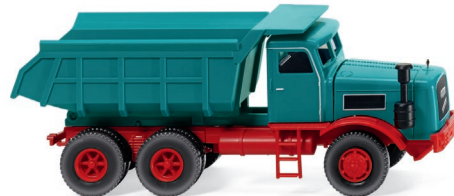
0866 34 Tipper trailer (Kaelble)