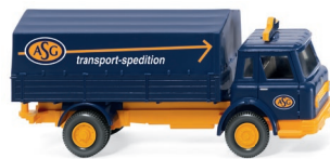
"ASG" component parts set