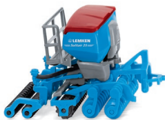
0378 11 Lemken Solitair/Zirkon till and drill combination 0378 19 Lemken Solitair/Heliodor till and drill combination