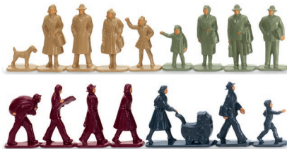
0018 17 Accessory pack – Groups of People