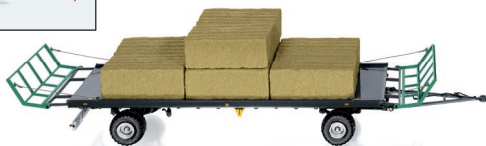
0778 31 Oehler ZDK 120 B Two-axle hay-bale trailer