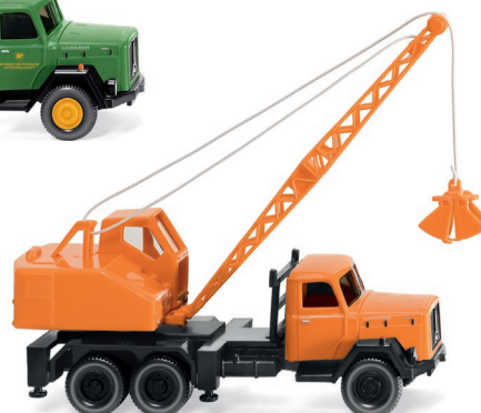
0662 03 Municipal mobile crane (Magirus/Fuchs)

Welcome new items: The triple-axle Magirus square hood is something to behold – it shines as a multi-functional excavator with a once much used "Fuchs" superstructure. And the legendary "Saturn" combination in the form of a BP tanker truck recalls the grand times of the air-cooled truck from Ulm. With the Unimog U 401, WIKING is closing an historic gap in the series of previous "Gaggenau" all-rounders. And to see out the year in which Wiking-Modellbau celebrated its 85th anniversary, the sixth VW T1 (type 2) appears