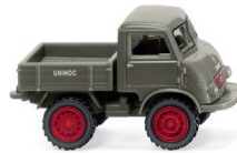
0368 01 Unimog U 401