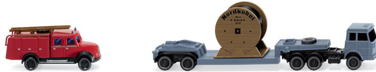
0961 39 Fire brigade – TLF 16 (Magirus) N-gauge 1:160 0949 39 Low-loader truck-trailer combination (Hanomag Henschel) N-gauge 1:160