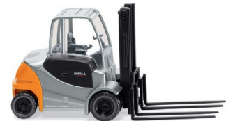
0663 61 Still RX 60 forklift truck