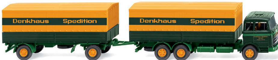
0456 01 Flatbed road train (MB 2223)