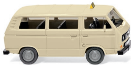
0800 14 Taxi – VW T3 Bus