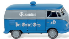
0788 04 VW T1 (Type 2) Van