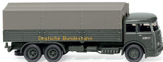
0479 02 Flatbed lorry (Büssing 12.000)

WIKING fascination generated from both old and new moulds: Encouraged by their initial success, the traditional model makers are now unveiling the Büssing 12.000 equipped with a tarp and painted in the colours of "Deutsche Bundesbahn". Inspired by more recent designs are the VW T1 Samba bus with export bumpers and the gorgeous contemporary Magirus S 3500, which is presented for the first time as a tank trailer thanks to a newly designed driver's cab and comes painted in the colours of "Rheinpreussen". WIKING showcases true classics to celebrate the 85th year of the company's history: These