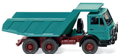
0671 05 Tipper trailer (MB NG)