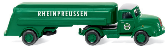
0800 49 Tank trailer truck (Magirus S 3500)