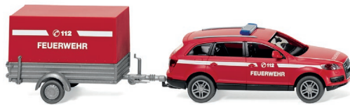
0133 07 Fire brigade – Audi Q7 with trailer