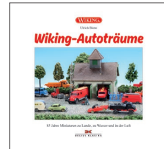
0006 45 Book "Wiking-Autoträume"