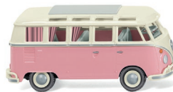
0797 20 VW T1 Samba bus