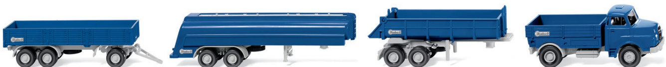
Component parts set "Blumhardt"