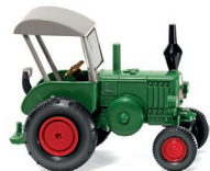
0880 08 Lanz Bulldog with top