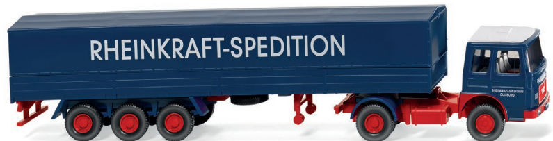
0517 01 Flatbed tractor-trailer (MAN)