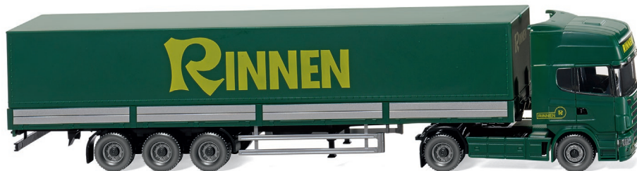
0518 04 Flatbed tractor-trailer (Scania R 420 Topline)