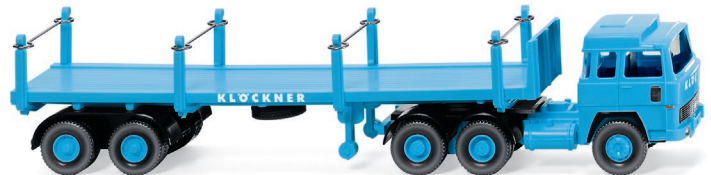
0518 46 Stanchion trailer truck (Magirus 235 D)