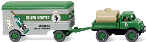
0371 06 Unimog U 406 with trailer