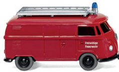
0861 41 Fire brigade – VW T1 van