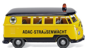
0797 19 ADAC - VW T1 bus