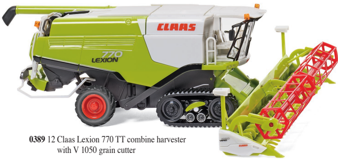
0389 12 Claas Lexion 770 TT combine harvester with V 1050 grain cutter