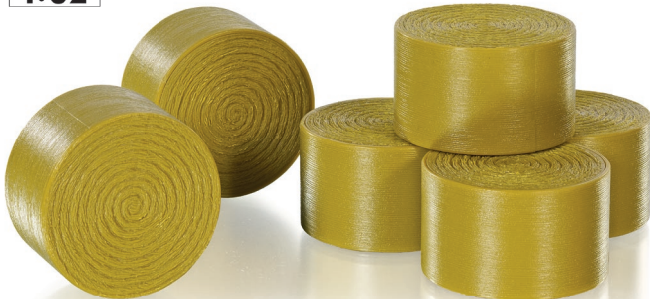
0773 93 Round bales, 6 items - Ø 54 mm

R ound bales are a common feature over the decades for Europe's fields. They are easily transportable to the front loader with no manual effort. Especially on farms, a compact tractor with lifting and simple bale unit is easy to move