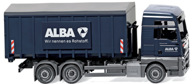
0672 04 Swap body (Meiller/MAN TGX Euro 6)