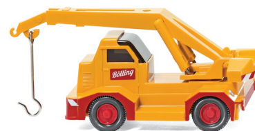
0680 02 Mobile crane (Demag)