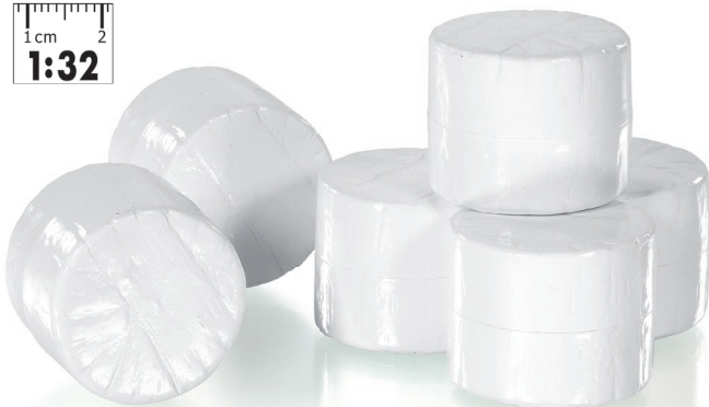
0773 92 Round bales in bale silage film, 6 items - Ø 35 mm

T hey're part of everyday life on the farm: Bale silage is increasingly popular and already has a firm place in milk production. Pressed bales packed in film are everywhere today and give high quality fermented fodder without too much waste. Silage bales can be used in dairy food fodder with great success. Harvested bales are compacted and stored in several layers of plastic film.