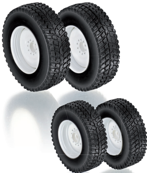
0773 96 Wheel set: Winter wheels for Valtra Baureihe T4

The Valtra T4 can be fitted with winter tyres and makes an outstanding model. This corresponds to the equipment fitted on municipal farms that are not