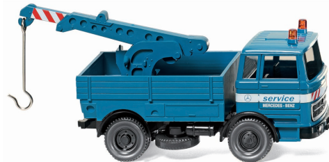
0634 03 Breakdown truck (MB 1620)