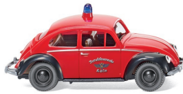
0861 37 Fire engine - VW Beetle 1200