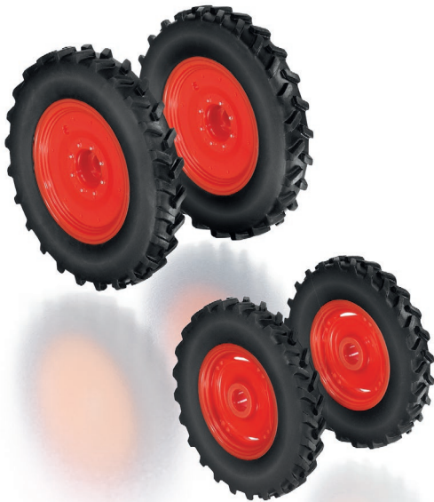
0773 95 Wheel set: Row crop wheels for Claas Arion 400

The Claas Arion 400 series is the perfect tyre type. Tyres provided by WIKING are obviously narrower and make the tractor more suitable for work in plant protection and special cultures. Thanks to the tyres the agricultural machine