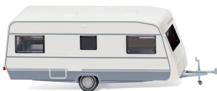
0092 03 Caravan (Dethleffs 530)