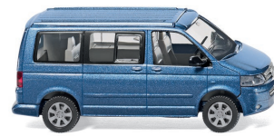
0273 40 VW T5 GP California