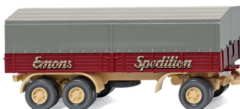
0416 03 Platform truck and trailer (MAN Pausbacke)