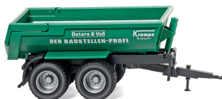
0388 14 Krampe Halfpipe Dumper