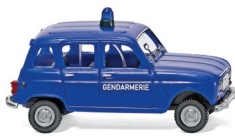
0224 04 Gendarmerie - Renault R4