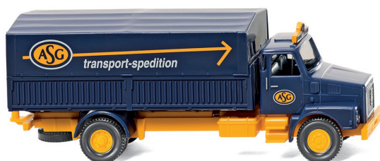
0462 01 Steel platform truck (Volvo N 10)