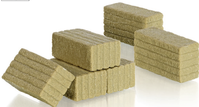
0773 94 Square bales, 6 items - 66 x 35 x 25 mm

T heir form also guarantees one of the main advantages: With optimum storage and stacking ability, square bales are becoming more widely accepted in farming. More farmers use simpler fork handling for bales that are very dry and