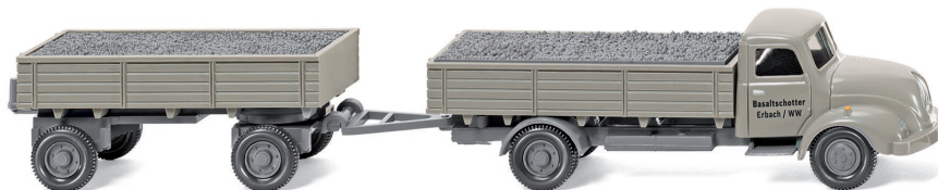
0420 01 Platform flatbed trailer (Magirus S 3500)

W IKING starts the harvest season with the brand new Claas Lexion 770 TT with the V 1050 grain cutter – an imposing machine with high precision standard. The functional Terra Trac has been miniaturized for the first time in the agricultural section - it stands for cross-country mobility of the latest harvester generation. The VW T5 GP California and the MAN TGX Euro 6 with the Meiller swap body in the colours of