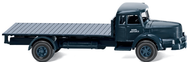
0480 04 Platform flatbed truck (Krupp Titan)