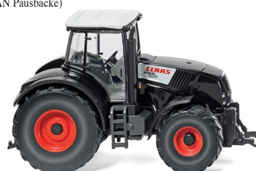
0363 02 Claas Axion 850

Traditional topics of WIKING become a valuable part of the model upgrading in August. The Swedish forwarding agency ASG once preferred the Volvo N 10 steel platform truck – WIKING now miniaturizes it in the colours of ASG. The favoured MAN “Pausbacke” completes the range of trucks in the colours of the well-known forwarder “Emons”. Following the fleet of the building company “Bölling” WIKING miniaturizes the “Demag” mobile crane for the historical