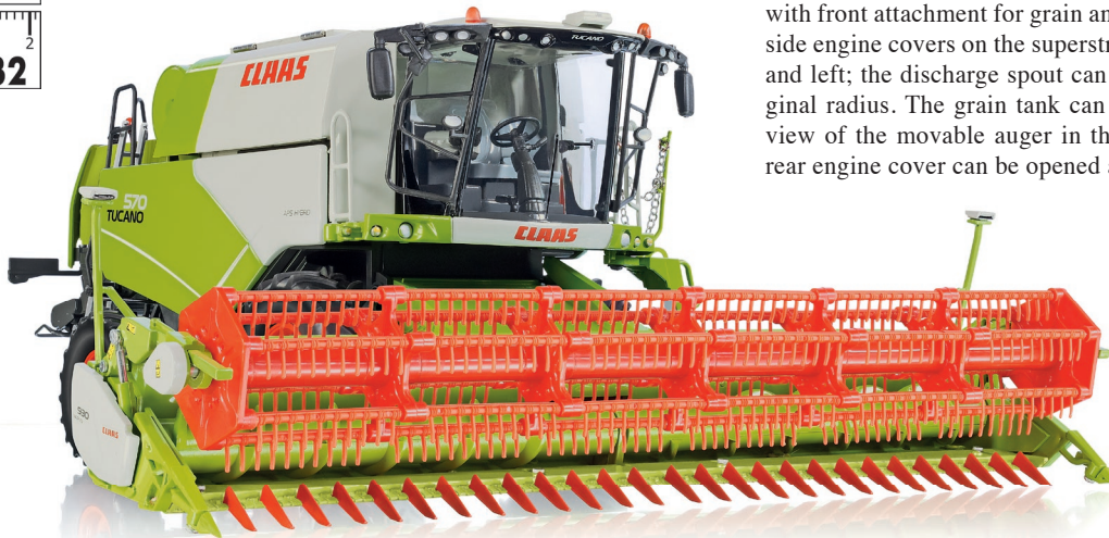
0778 17 Claas Tucano 570 combine with V 930 front attachment for grain

W IKING premiere for a new Claas combine generation: A modelmaking masterpiece with full functionality is making its debut: the Tucano 570 with front attachment for grain and cutting unit trolley. The side engine covers on the superstructure can be opened right and left; the discharge spout can be pivoted true to the original radius. The grain tank can be opened and provides a view of the movable auger in the interior. In addition, the rear engine cover can be opened and the air intake grille rotates. The entire combine model offers maximum mobility through the rear swing axle. In addition, the fully transparent cab lets you experience the work place in all its details.