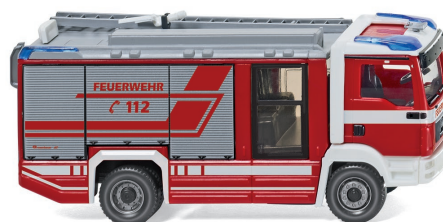
0612 47 Fire department - Rosenbauer AT LF (MAN TGM)

That's how 1:87 fans dream of the model-making springtime: With the WIKING model update, the stunning Glas 1700 GT convertible, which is reminiscent of the late production years of the Dingolfing-based Hans Glas GmbH, joins the model portfolio. Nonetheless, even the elegance of the model body that emerged from the Italian designer workshop of Frua could not prevent the takeover by BMW. The Unimog U 411 is showcased in the traditional colors of the "Freyaldenhoven" shipping company. It pulls a trailer just like its prototype on the company grounds