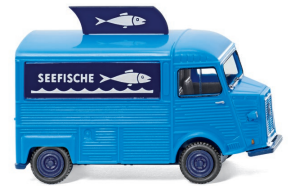
0262 05 Citroën HY sales vehicle