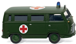
0695 08 German Armed Forces - Ford FK 1000 Bus