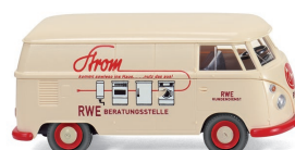
0797 17 VW T1 panel truck