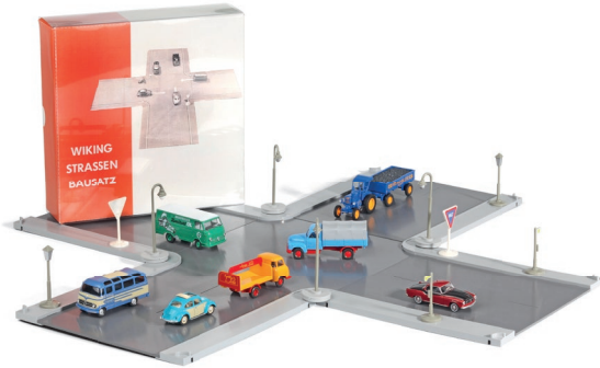
1199 01 Road-building set (without models/accessories)