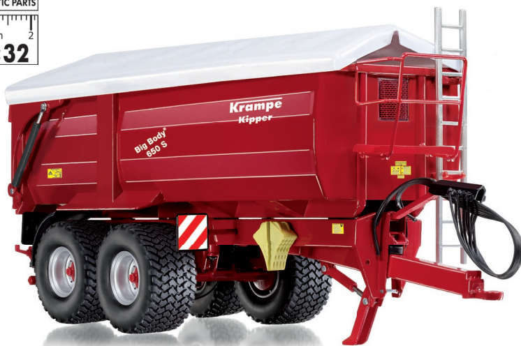
0773 35 Krampe Big Body 650 S rear/side tipper

T he loading miracle radiates the allure of the scale: The Krampe Big Body 650 S unfolds its specialist feature so useful for everyday work as a precision miniature as well. The trailer has a precise side tipping function, which lifts the trough in a true-to-prototype angle. Two additional flaps on the left side can be opened in order to position the load unerringly to its intended storage location. By means of pins on the chassis, the tipping function can be switched to the rear unloading function. In addition, the drawbar is height-adjustable, the support leg can be moved, and the ladder can be removed and positioned at various heights. The rear axle can be steered.