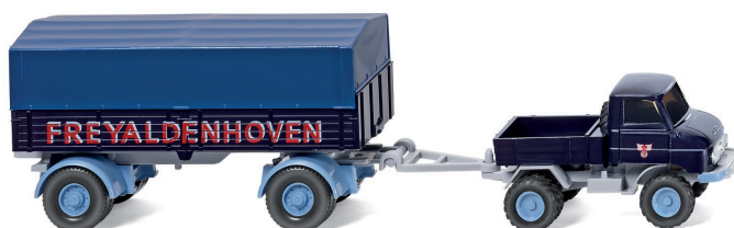
0371 04 Unimog U 411 with trailer