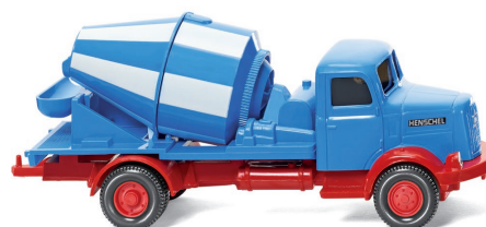
0532 01 Concrete mixer (Henschel HS 100)