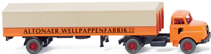
0514 03 Flatbed truck (MAN)