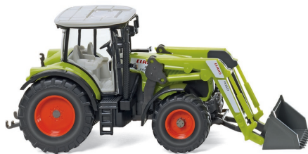
0363 11 Claas Arion 630 with front loader 150