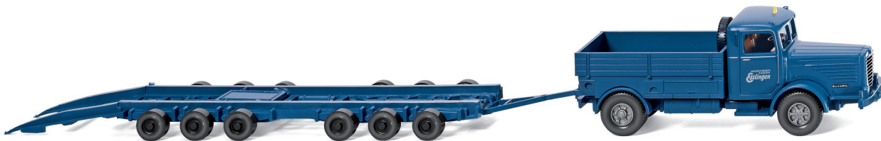
0590 01 Culemeyer low-loader (Büssing 8000)

Beautiful classic vehicles to welcome the spring! It has finally arrived – the Henschel HS 14/16, making its debut as a long-awaited container semi-truck. The Ford FK 1000 in the colors of the German Armed Forces with a new circle lamp as well as the Citroën HY, whose side shop counter can be opened, are further legendary classics from new and old molds. The Büssing 8000 pulls the Culemeyer low-loader, the DKW F 89 drives up for public duty in the fire department, and the VW Beetle 1200 is the “Yellow