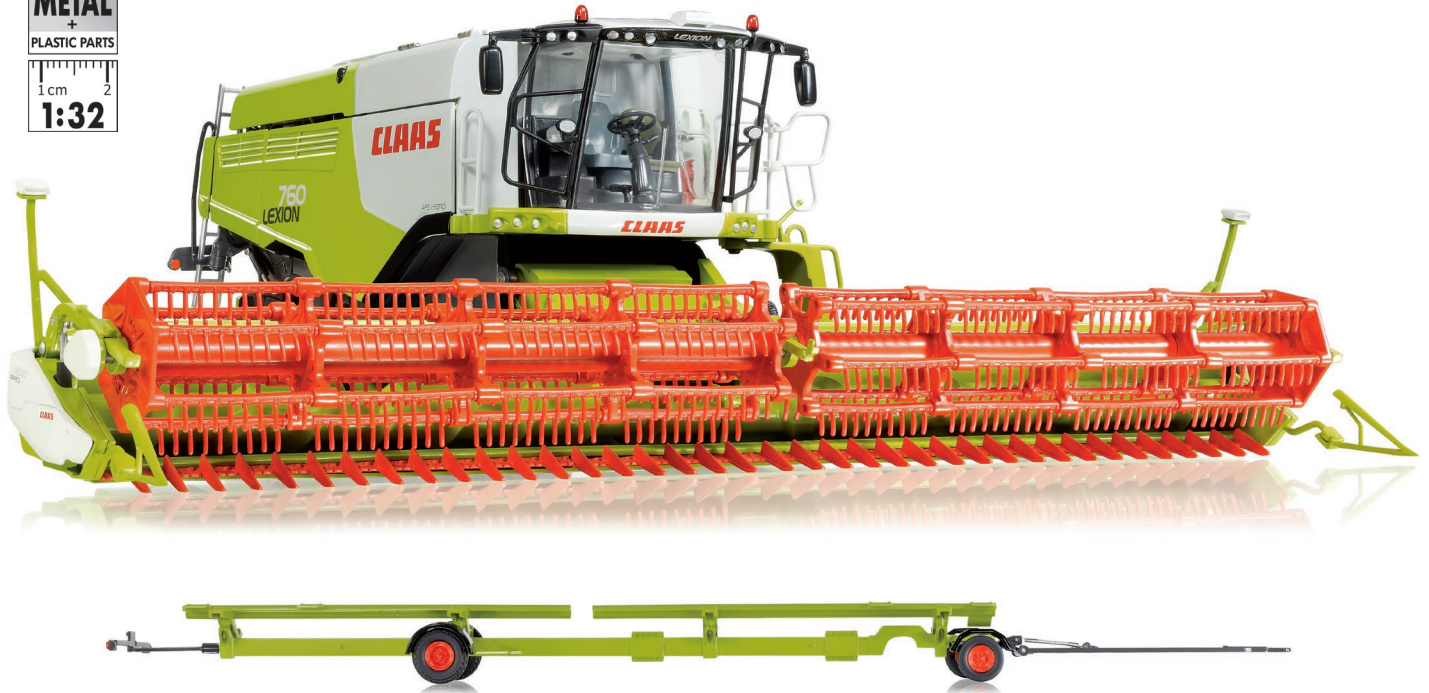
0778 24 Claas Lexion 760 TT combine with V 1200 front attachment for grain

Cutting-edge technology in 1:32 – for the first time, WIKING fits a combine with a fully functional caterpillar drive! The modelmakers have miniaturized the Claas Lexion 760 TT combine with the V 1200 cutting unit, impressive in both its width and design. The powerful 1:32 miniature has the functionality known from the Lexion 770, which makes this model just as unmistakable as its prototype. With the Claas Lexion 760 TT, WIKING has for the first time produced a combine in the 1:32 scale that can easily compete with the original in terms of functionality and attention to detail. The front-mounted, removable V 1200 high-performance cutting unit has a height-adjustable rotor with free-floating tines and can be transported to the next field to be harvested by means of the vehicle for the cutting unit. Numerous true-to-prototype details, such as the engine and ventilation flaps that can be opened and the horizontally-rotatable straw chopper will enthral viewers immediately. In addition, the elaborate opening mechanism of the grain tank – which can bunker up to 12,500 liters of grain in reality – makes the inside “floating” auger visible. In the 32-fold minia-