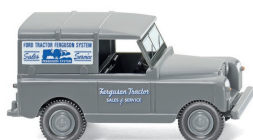
0100 03 Land Rover