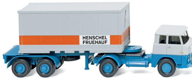
0526 01 Container semi-truck 20' (Henschel HS 14/16)