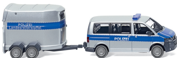
0308 07 Police - VW T5 GP Multivan with horse trailer