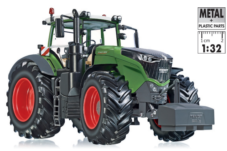
0773 49 Fendt 1050 Vario

s a "German Masterpiece," the Fendt 1050 Vario has gone down in Fendt history! Due to its imposing size alone, the side and front windows of the "x5 S" cab of the new Fendt 1050 Vario have been lowered for optimum lines of sight. The model is a winner - driver's seat and steps are foldable, driver's door and cab window can be opened. One highlight is the miniaturization of the engine hood, which is secured manually by belts. The variably-designed upper link of the rear hydraulics system is now extendable in its length. Again, the wheels of this precision model are removable.