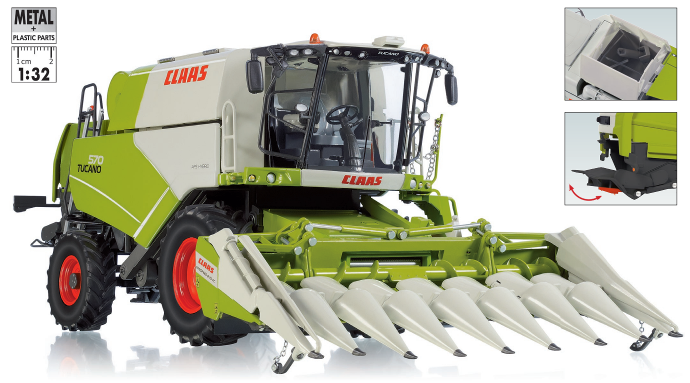
0778 18 Claas Tucano 570 combine with Conspeed corn header 8-75

on the front entryway finely-detailed safety chains; the lower step of the entryway is flexibly mounted. The corn header can be widened from the transport position into the working position by hinging it down. The cutting edges are individually rotatable; the auger rotates just like in the prototype.