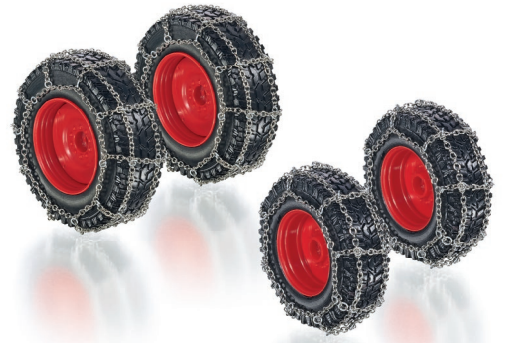
0773 91 Wheel set with chain set for Fendt 828

Perfect additional equipment: WIKING gets the Fendt 828 Vario ready for special use! A set of tire chains makes every single one of the removable tires suitable for winter.