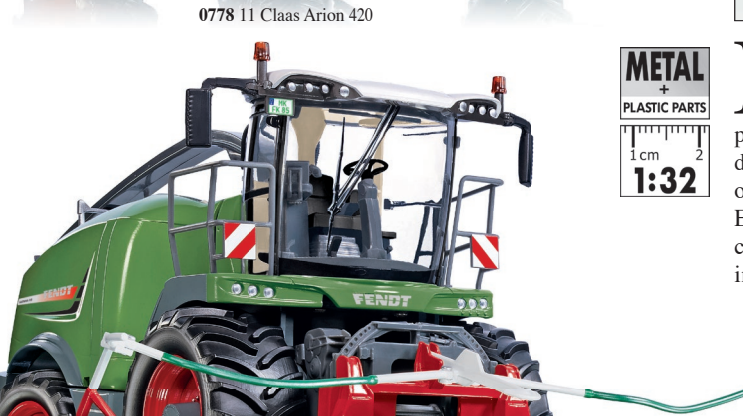
0778 13 Fendt Katana 85 forage harvester

his is the entry into the handy tractor range of Claas. WIKING miniaturizes the Arion 420, whose "Panoramic" cab has a transparent roof. The doors and rear windows can be opened. When the engine hood is open, the oil coolers can be tipped up individually as is normal for maintenance. In addition, the right-side ladder is arranged so it's movable. For off-road use, the chassis has a swing axle. The wheels with their magnetic hubcaps can be removed using the enclosed wrench and be put into maintenance position.